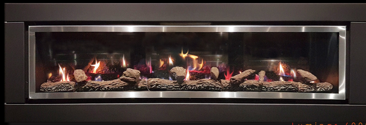
Luminar 6000 Dual Fan

Fully tested and approved to Australian Standards, you can rest assured the Luminar Inbuilt Gas Log Fires are built with the safety of you and your family a priority. All Luminar Gas Log Fires are sealed units which draw combustion air for the fire from outside the building.