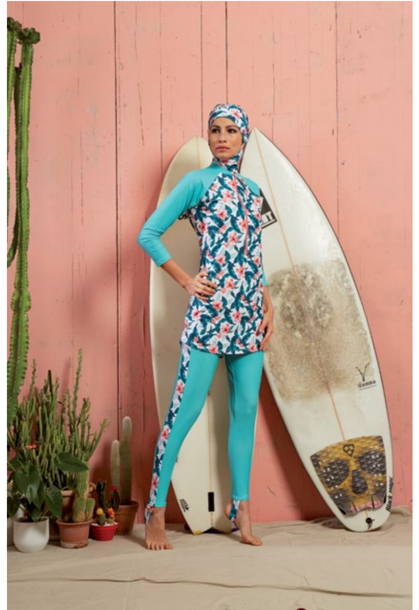
"... girls surf too!...."