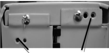
Screw holes in base of heater