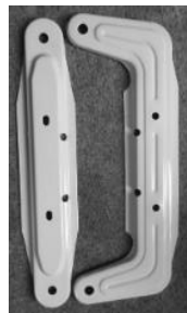
7 Fin Castor Plates x2