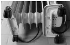
7 Fin Castor Plates