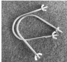
U-shape Bolt x 2 Wing Nut x 4