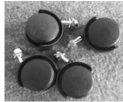
Wheel Castor x4