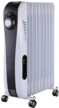
Main Body x1