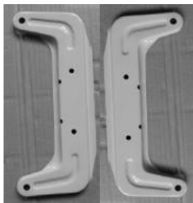
5 Fin Castor Plates x2