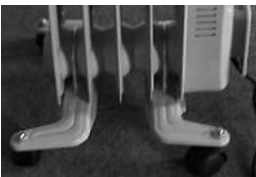
5 Fin Castor Plates

WARNING: Only operate the heater in normal upright position with wheel assemblies attached to the bottom, any other position could create a hazardous situation.