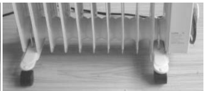
11 Fin Castor Plates