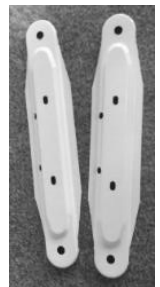
11 Fin Castor Plates x2