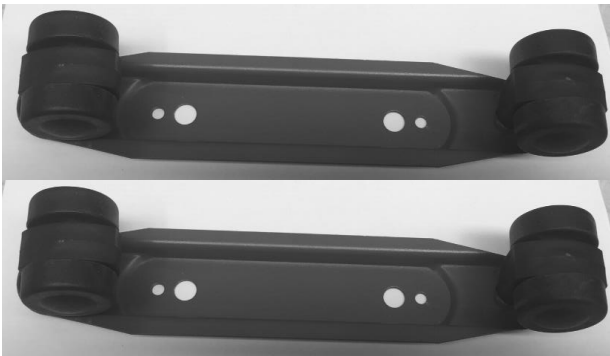
Wheel Plates & Castors x 2