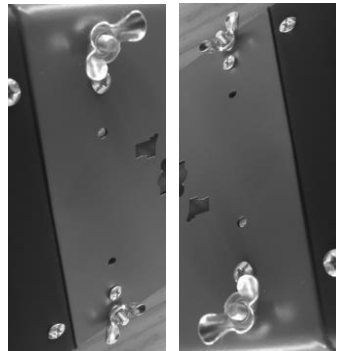
Wing Nuts x 4