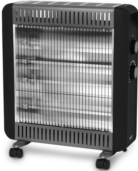
Main Body x 1