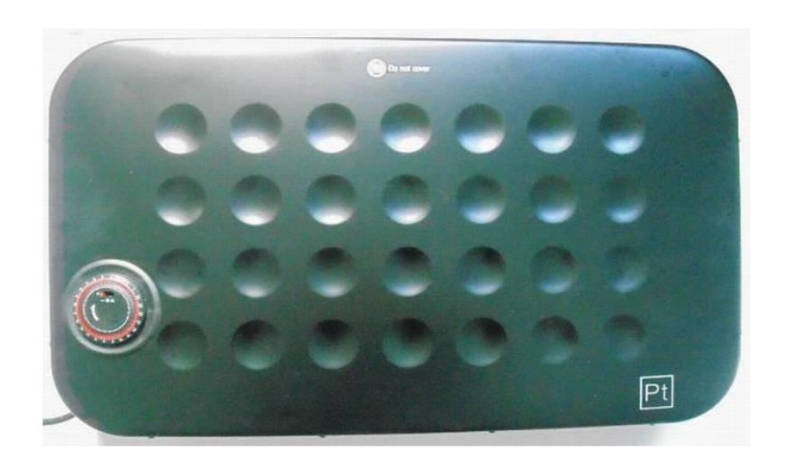
Main body x 1