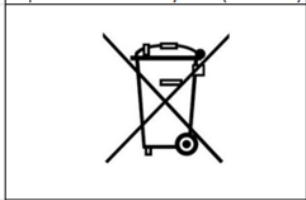
Separate Collection Symbol (Batteries)

Consult your local council for information regarding available recycling and/or disposal options.