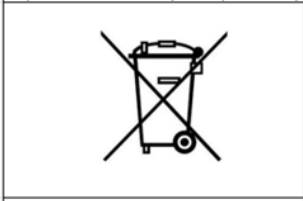
Separate Collection Symbol (Batteries)

Consult your local council for information regarding available recycling and/or disposal options.