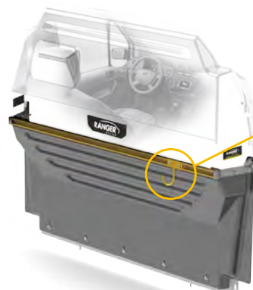
3320 FTL Clear Polycarbonate Top Max View Composite Partition