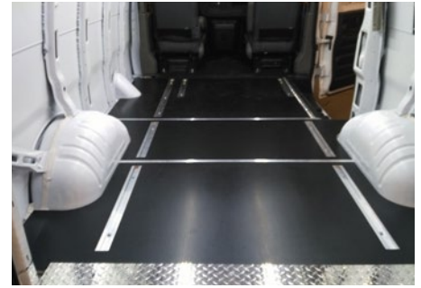
Aluminum sills at the side and rear doors