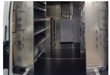
Extruded aluminum joints where floor pieces meet