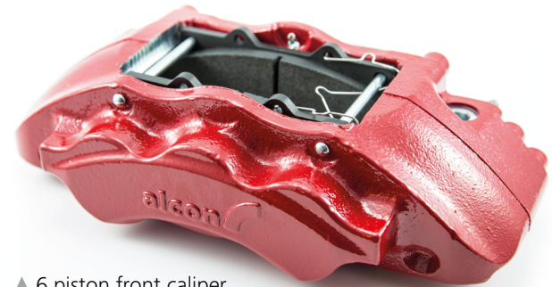
▲ 6 piston front caliper

WARNING: This product can expose you to chemicals including Chromium, Lead, Lead Compounds, Nickel (Metallic) Nickel Compounds, Diisonyl and Di(2-ethylhexyl) Phthalates (DEHP)(DINP) which are known to the State of California to cause cancer or birth defects or other reproductive harm. For more information, visit www.P65warnings.ca.gov .