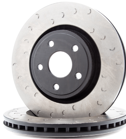
▲ 350mm front rotor