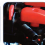
QC Drain Line