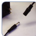
QC Power Cable