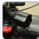
QC Brine Line