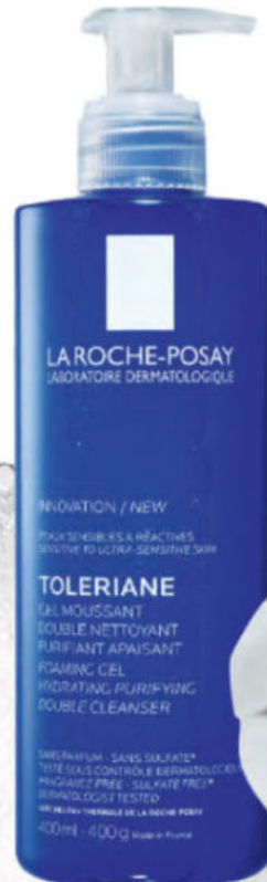
LA ROCHE-POSAY Toleriane Double Cleanser , £24