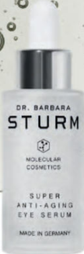
DR BARBARA STURM Super Anti-aging Eye Serum , £250