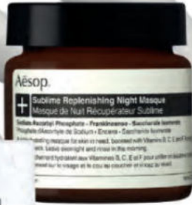
AESOP Sublime Replenishing Night Masque , £97