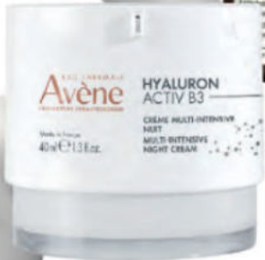
AVENE Hyaluron Activ B3 Multi-Intensive Night Cream , £39, at Boots