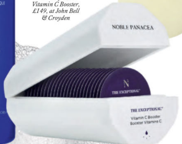
NOBLE PANACEA The Exceptional Vitamin C Booster , £149, at John Bell & Croyden