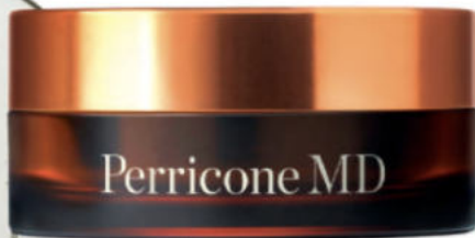
PERRICONE MD Essential Fx Acyl-glutathione Chia Cleansing Balm , from £39

OVERNIGHT nourishment to PROTECT, soothe and RE-ENERGISE