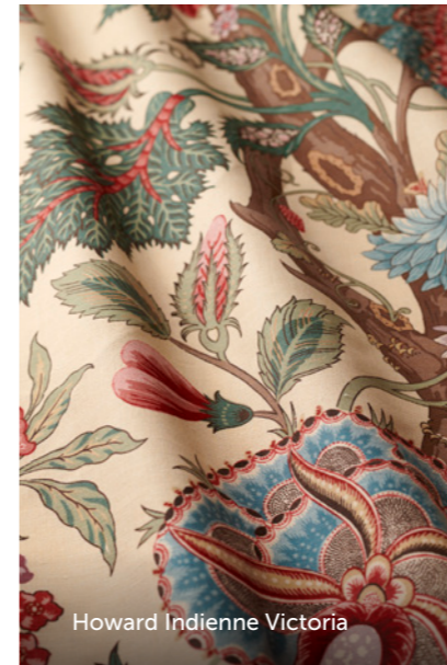
Howard Indienne Victoria

Code F0399-01 Composition 100% C Width 112cm Pattern repeat 69cm