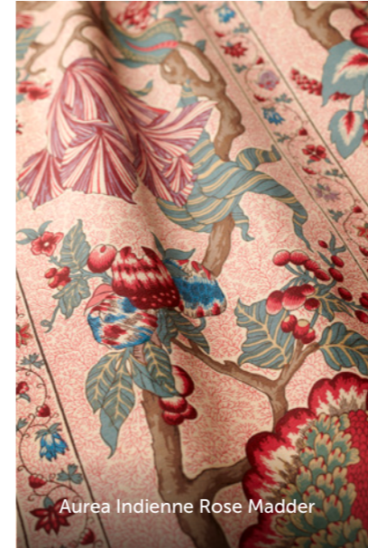
Aurea Indienne Rose Madder

Code F0395-01 Composition 52% L 36% C 12% N Width 127cm Pattern repeat 77cm