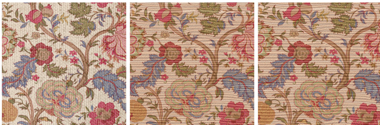
Rosalind Indienne Colour: Lords and Ladies Linen Code: WCH003-01 Width: 79cm / 31.1ins Vertical repeat: 45.7cm / 18ins Half drop Substrate: Paperbacked Linen Rosalind Indienne Colour: Clamshell Orchid Grasscloth Code: WCH009-01 Width: 70cm / 27.6ins Vertical repeat: 40.7cm / 16ins Half drop Substrate: Grasscloth Rosalind Indienne Colour: Slipper Orchid Code: WCH016-01 Width: 70cm / 31.1ins Vertical repeat: 40.7cm / 18ins Half drop Substrate: Non woven paper