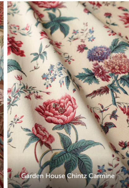
Garden House Chintz Carmine

Code F0394-01 Composition 52% L 36% C 12% N Width (Fabric + Border) 84cm + 33cm Supplied together Pattern repeat 128cm