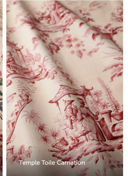
Temple Toile Carnation

Code F0397-01 Composition 52% L 36% C 12% N Width 120cm Pattern repeat 51cm