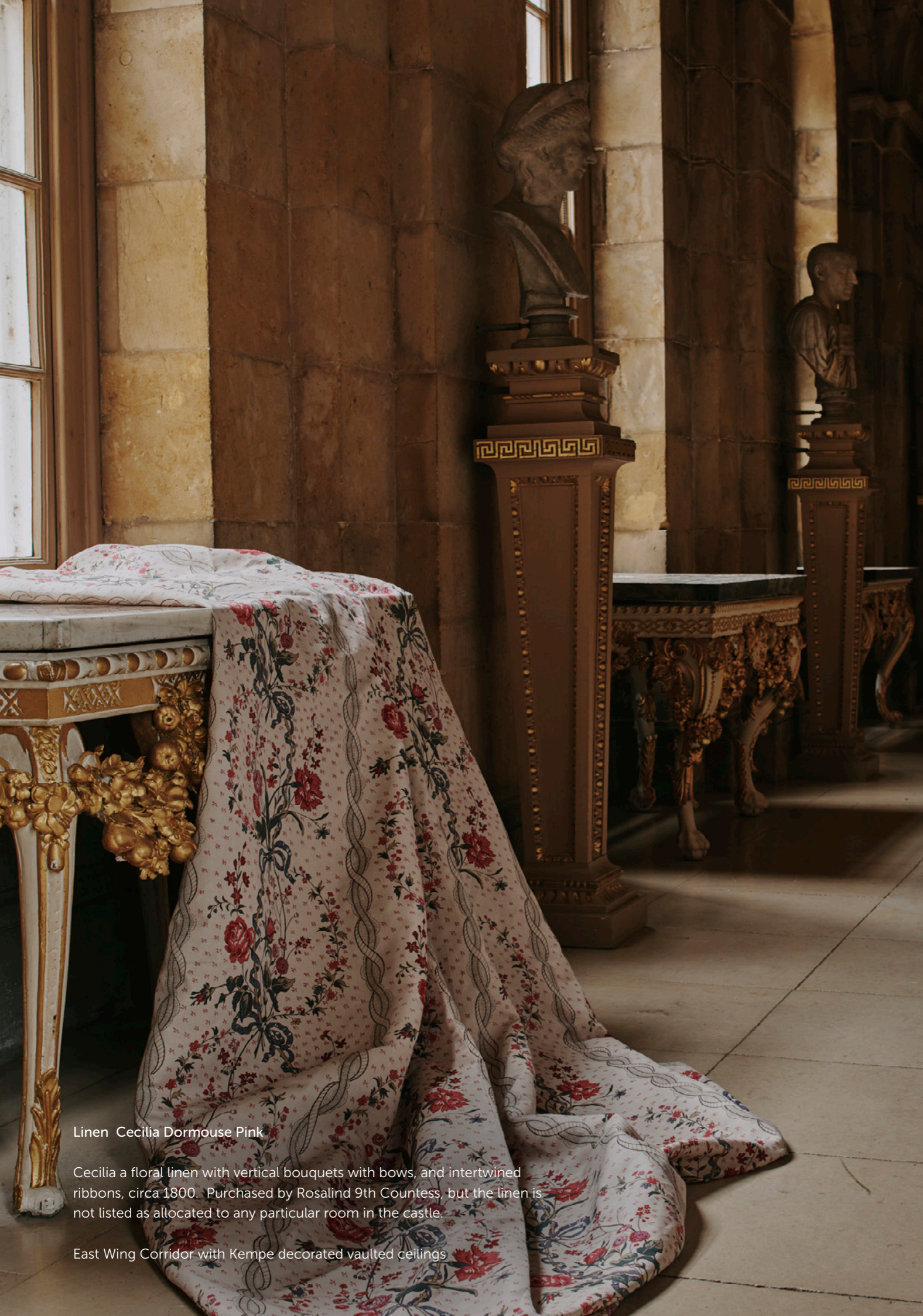
Linen Cecilia Dormouse Pink

Cecilia a floral linen with vertical bouquets with bows, and intertwined ribbons, circa 1800. Purchased by Rosalind 9th Countess, but the linen is not listed as allocated to any particular room in the castle