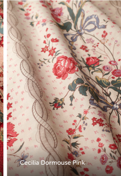
Cecilia Dormouse Pink

Code F0395-01 Composition 52% L 36% C 12% N Width 127cm Pattern repeat 77cm