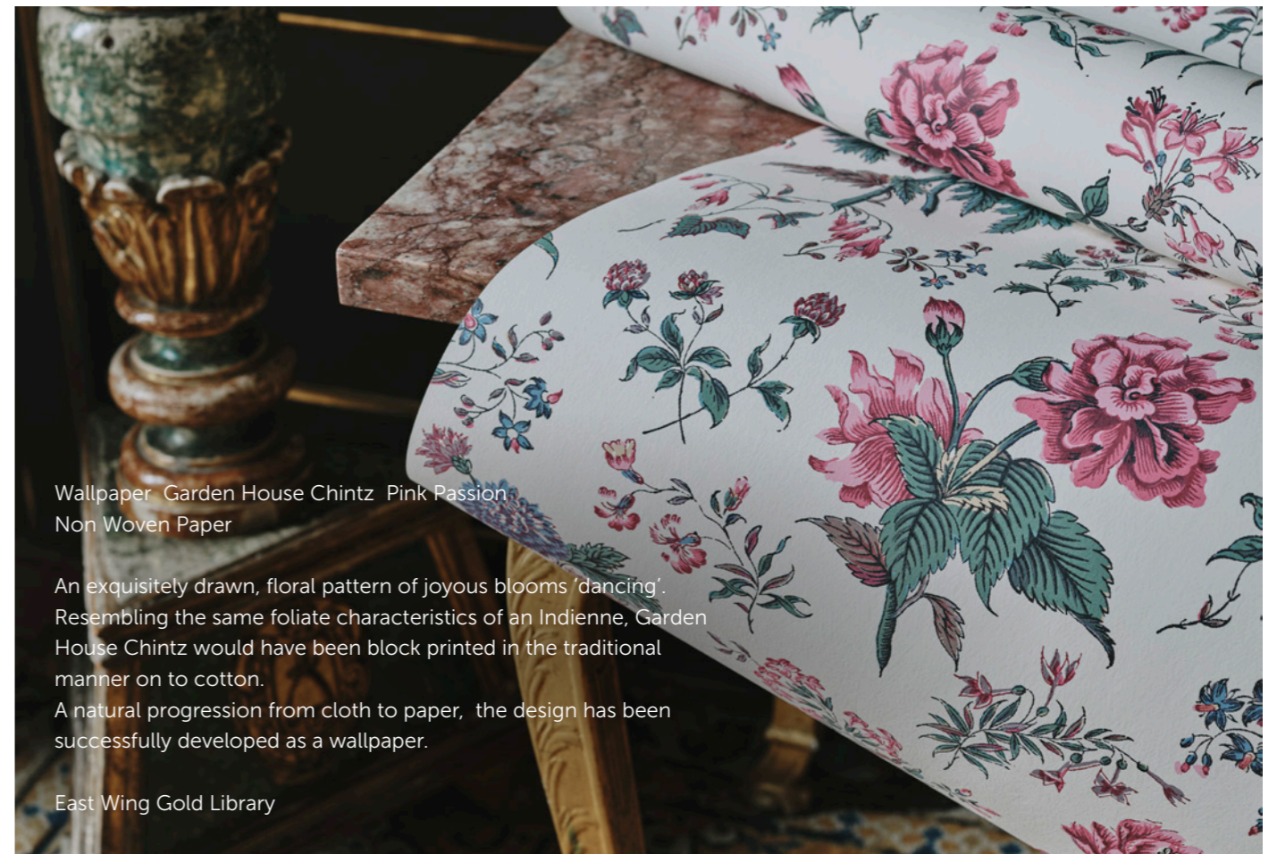
Wallpaper Garden House Chintz Pink Passion Non Woven Paper

An exquisitely drawn, floral pattern of joyous blooms 'dancing'. Resembling the same foliate characteristics of an Indienne, Garden House Chintz would have been block printed in the traditional manner on to cotton.