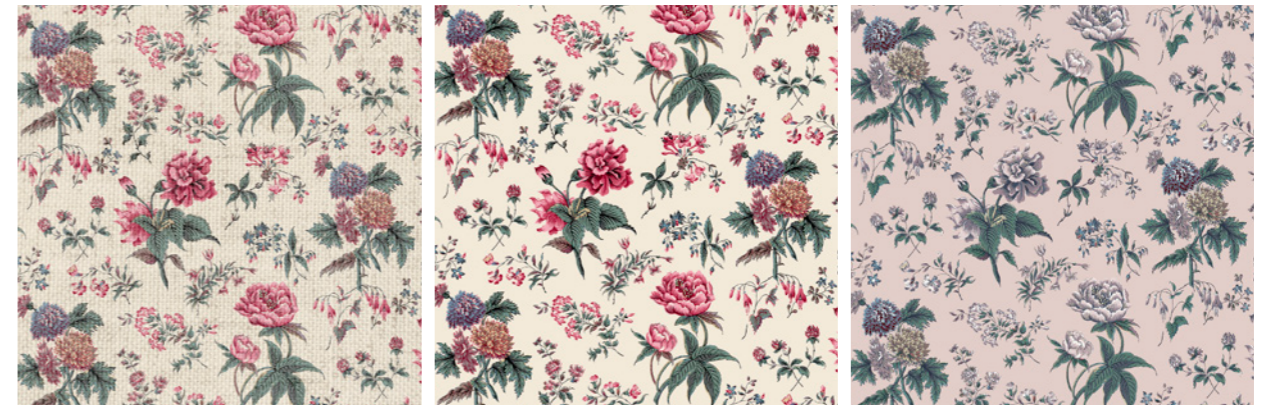
Garden House Chintz

Colour: Hips and Haws Linen Code: WCH001-01 Width: 104cm / 40.9ins Vertical repeat: 49cm / 19.3ins Half drop