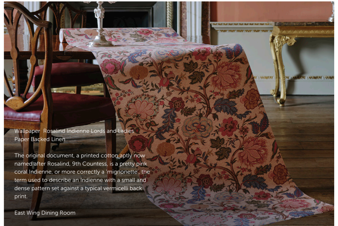
Wallpaper Rosalind Indienne Lords and Ladies Paper Backed Linen

East Wing Corridor with Kempe decorated vaulted ceilings