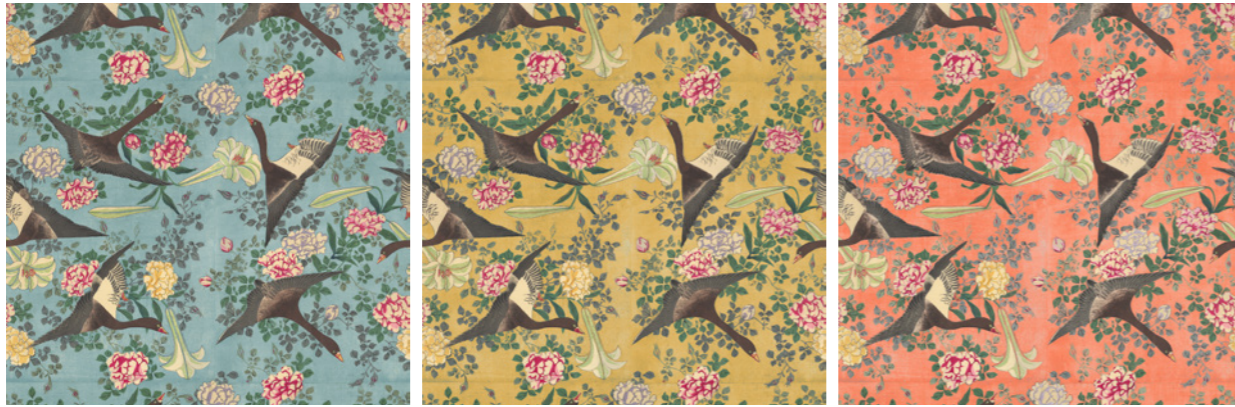
Goose Colour: Blue Code: WCH172-01 Width: 70cm / 27.6ins Vertical repeat: 104cm / 40.9ins Straight match Substrate: Non woven paper Goose Colour: Mustard Code: WCH172-02 Width: 70cm / 27.6ins Vertical repeat: 104cm / 40.9ins Straight match Substrate: Non woven paper Goose Colour: Coral Code: WCH172-03 Width: 70cm / 27.6ins Vertical repeat: 104cm / 40.9ins Straight match Substrate: Non woven paper