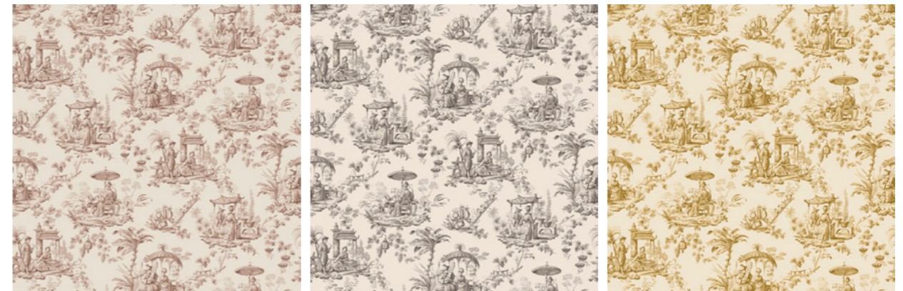
Temple Toile Colour: Victorian Mauve Code: WCH006-01 Width: 52cm / 20.5ins Vertical repeat: 68.7cm / 27ins Half drop Substrate: Non woven paper Temple Toile Colour: Bowler Hat Code: WCH006-02 Width: 52cm / 20.5ins Vertical repeat: 68.7cm / 27ins Half drop Substrate: Non woven paper Temple Toile Colour: Golden Retriever Code: WCH006-03 Width: 52cm / 20.5ins Vertical repeat: 68.7cm / 27ins Half drop Substrate: Non woven paper