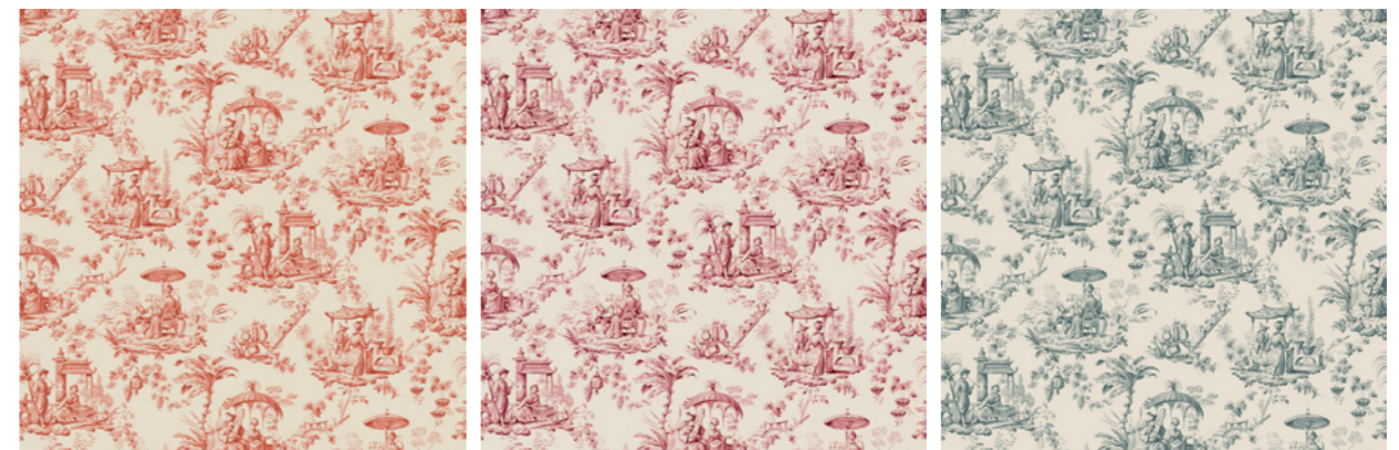
Temple Toile Colour: Redcurrant Code: WCH006-04 Width: 52cm / 20.5ins Vertical repeat: 68.7cm / 27ins Half drop Substrate: Non woven paper Temple Toile Colour: Carnation Code: WCH006-05 Width: 52cm / 20.5ins Vertical repeat: 68.7cm / 27ins Half drop Substrate: Non woven paper Temple Toile Colour: Prussian Sea Code: WCH006-06 Width: 52cm / 20.5ins Vertical repeat: 68.7cm / 27ins Half drop Substrate: Non woven paper