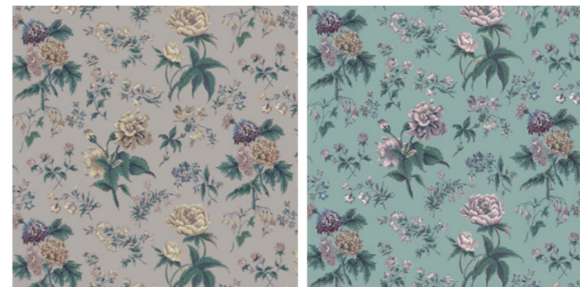
Garden House Chintz

Colour: Old Lavender Code: WCH0014-03 Width: 52cm / 20.5ins Vertical repeat: 49cm / 19.3ins Half drop