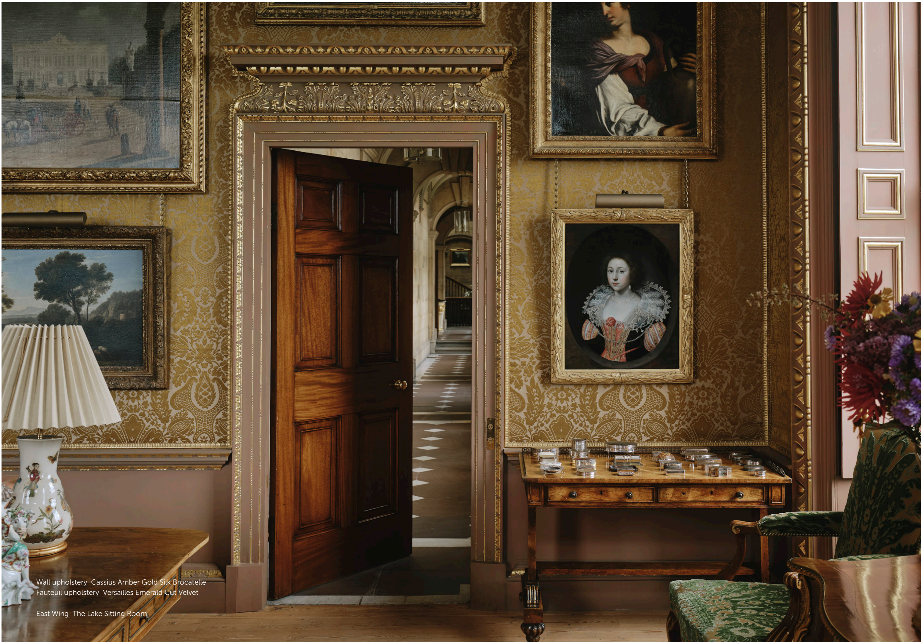
Wall upholstery Cassius Amber Gold Silk Brocatelle Fauteuil upholstery Versailles Emerald Cut Velvet