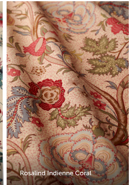
Rosalind Indienne Coral

Code F0398-01 Composition 100% C Width 134cm Pattern repeat 41cm