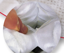
Destructive bonds to non-woven material