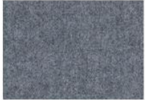
GREY: LDS16 PARTNER