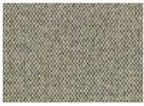
BEIGE: MLF02 ARCHWAY