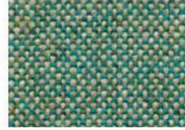
GREEN: MLF24 BAYSWATER