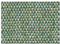
PEAR GREEN: MLF09 MONUMENT