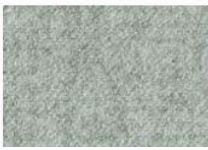
LIGHT GREY: LDS08 SERENDIPITY