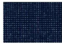
DARK BLUE: PAT19 RIPPLED