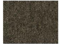
BROWN: MLF16 TEMPLE