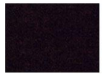
BLACK VIRGIN WOOL: LDS88 PROCESS