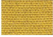
YELLOW: MLF17 TOOTING