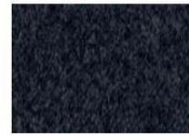
DARK GREY: LDS17 MIX