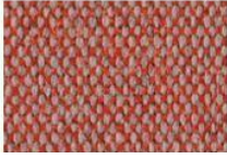
BURNT RED: MLF03 BARBICAN