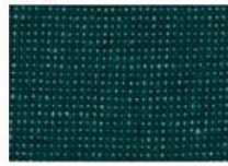
EMERALD GREEN: PAT05 RECLAIMED