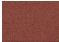
BRICK RED: LDS77 COMBO