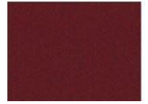
BURGUNDY: LDS79 AMIABLE