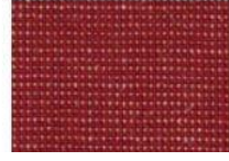
LIGHT BURGUNDY: PAT36 TWISTED