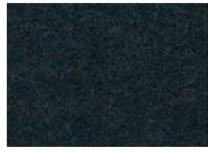
CHARCOAL: LDS41 COUPLE