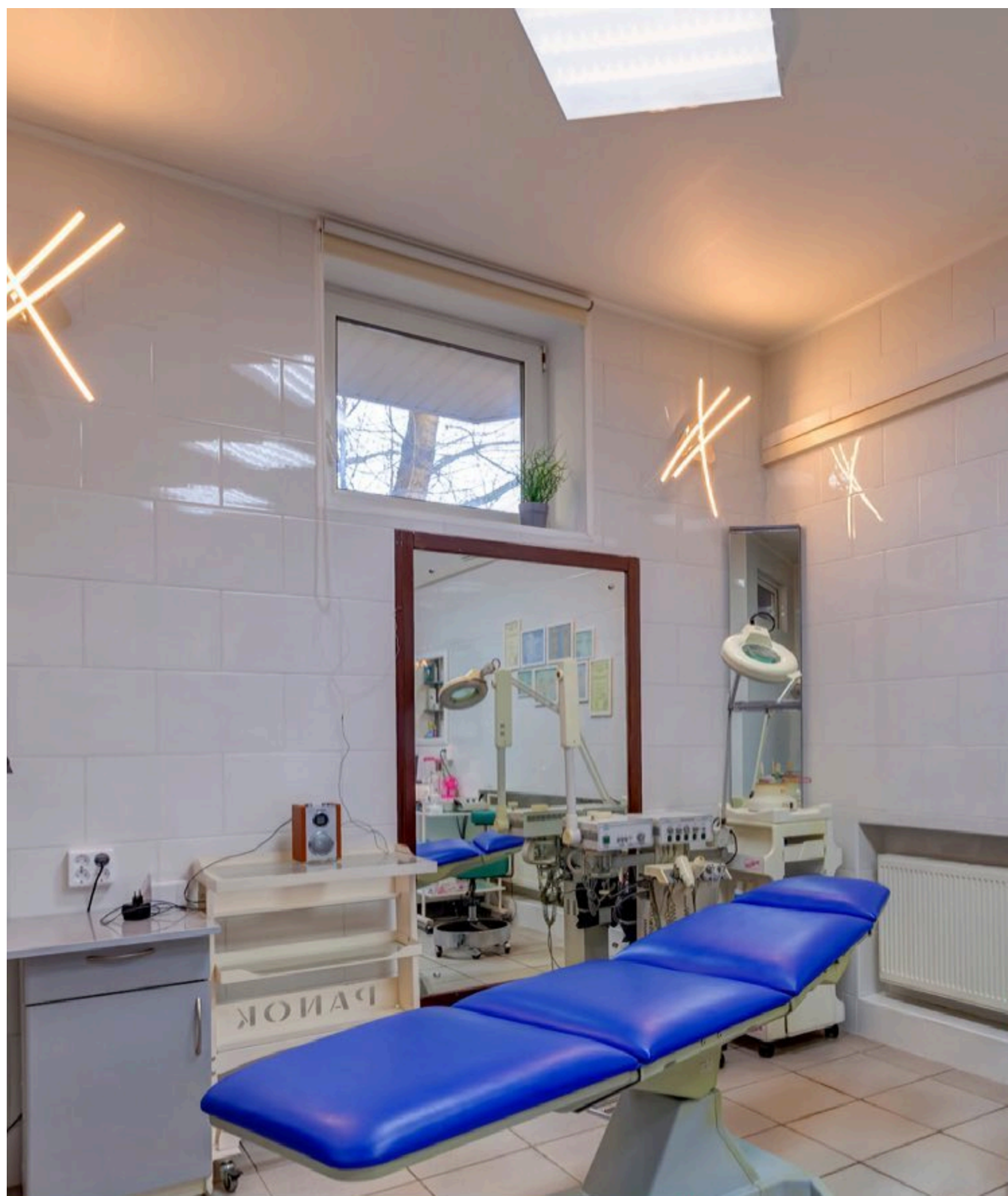
Процедурный кабинки многопрофильной