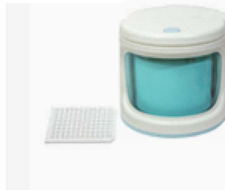
Plate Spinner Microplate fuge