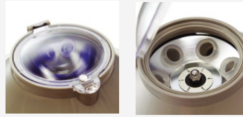
Fixed angle Rotor included