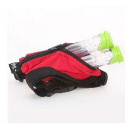
Austin, TX – From EpiPens to insulin pumps, there are common medical devices that many can't live without and must always have on-hand. SPIbelt ® (Small Personal Item Belt), an apparel line of uniquely innovative products that have become staple accessories among the Type 1 Diabetes community, runners, triathletes, and travelers, offer the ideal belt for holding everyday medical supplies safely, seamlessly and discreetly.

The SPIbelt is a trusted companion for individuals with special medical needs and can be comfortably and discreetly worn over or under clothing. Its expandable pocket can carry diabetic and medical supplies such as blood glucose meters, insulin pumps, syringes, fast-acting glucose, EpiPens, inhalers, or insulin vials and pens. The SPIbelt will keep these items and a cell phone, keys, cash, and identification safe and secure on your body, so you can live out each day feeling prepared and at ease. SPIbelt's kids' products are designed for parents to feel confident that their child has a dependable and discreet way to be physically active while wearing an insulin pump or other similar sized medical devices.