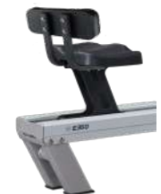
SEAT BACK KIT