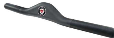
TOUCH HEART RATE HANDLE