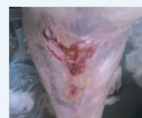
Fig 2: 19 weeks after treatment with UrgoKTwo