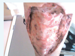
Fig 1: Six weeks after the fall following debridement