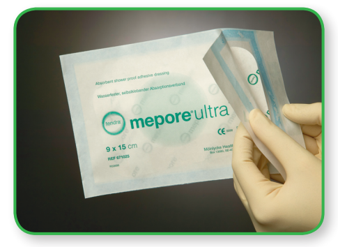
1. Open the package and remove the dressing.