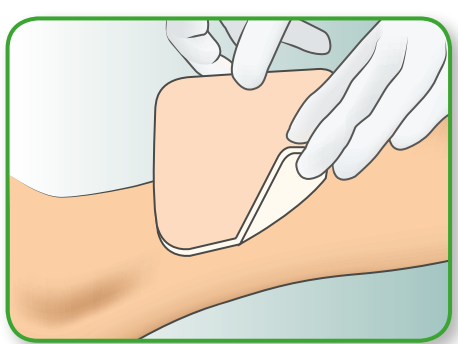
2. Place the foam side directly onto the wound surface, overlapping the wound margin by about 2cm.