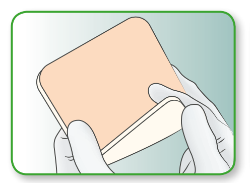
Clean the wound area and select a suitable size of Lyofoam Max.