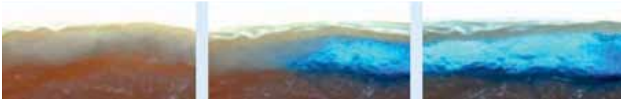
Figure 2 Micro-contouring

AQUACEL® Ag Dressing covered by DuoDERM® Extra Thin dressing applied to a simulated wound surface