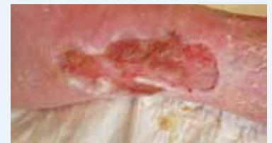
The wound on 30 June, 2010 (50cm 2 )