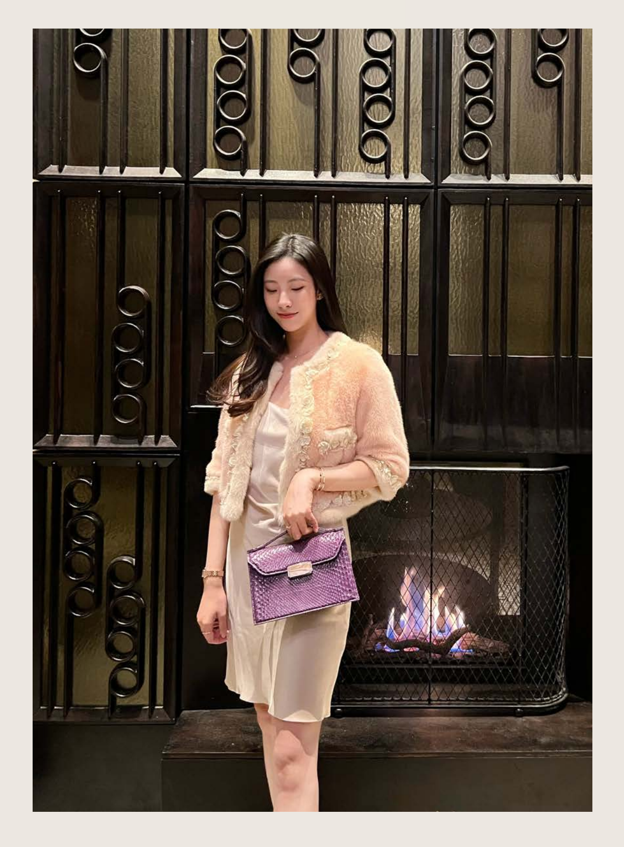
ART DECO COLLECTION