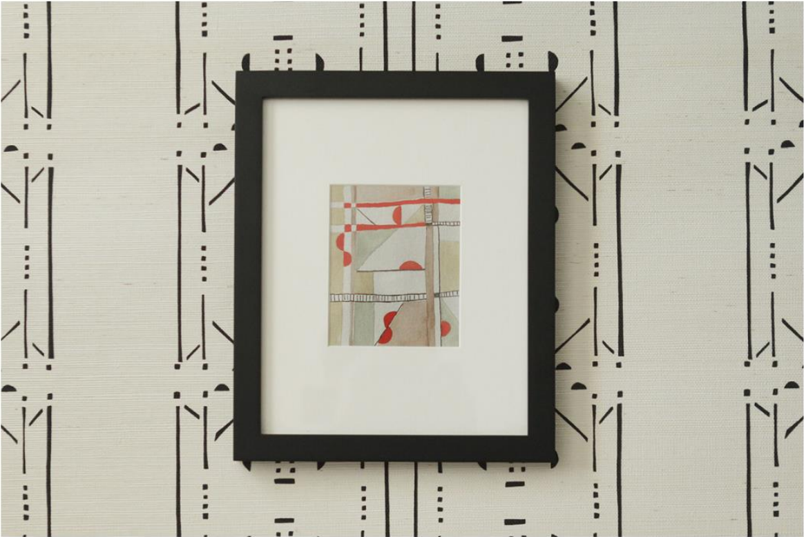
AKAN: ONYX.

“Wallpaper is experiencing an ‘anything goes’ moment,” Perdigon says. “While I’m not seeing a specific trend, there are many more niche designs on the market. From exciting geometrics to painterly murals, to more soothing textural patterns, a designer can find anything to fit the space and mood they’re trying to create. This makes it an easy way to add both subtle and bold personality to a room. With painted walls, you only get the shock or subtlety of the color, not the personality of the motif. You can really create a design narrative with wallpaper.”