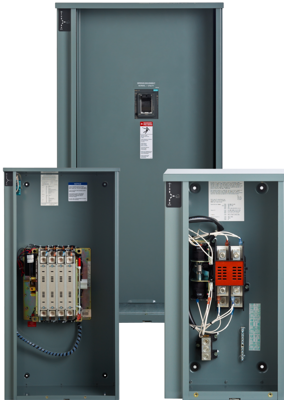
Covers have been removed for illustration.