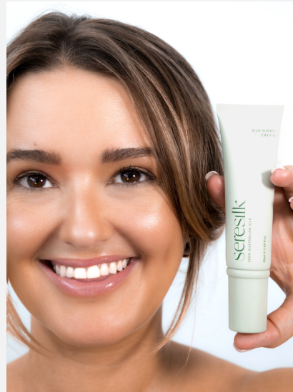
Product & Founder Imagery