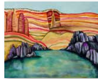
RUBY HORSETHEIF #CRD030