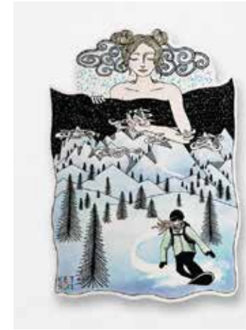
SNOWBOARD DREAMS #STKR002