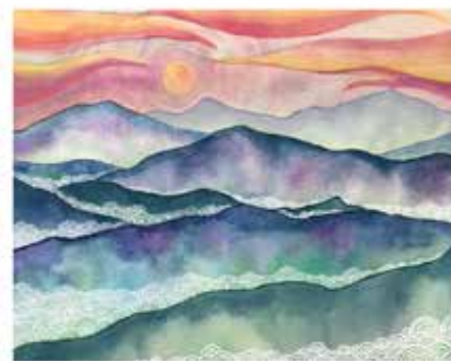
BLUE RIDGE MOUNTAINS #AP013