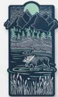
PINEY MOOSE #STKR018