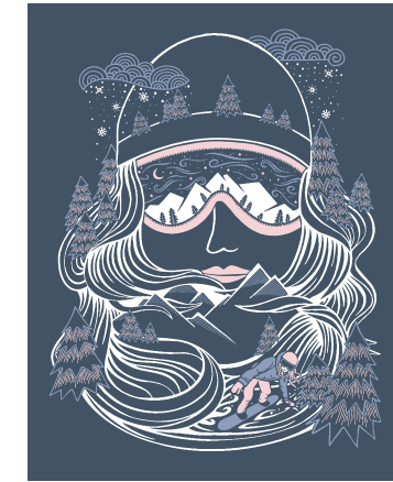
POWDER DAY #AP002