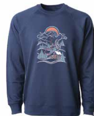
BACKCOUNTRY #UP02 NAVY