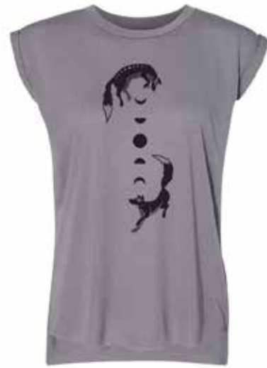
FOXES #WRS06 STORM