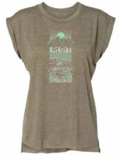
PINEY MOOSE #WRS02 HEATHER OLIVE