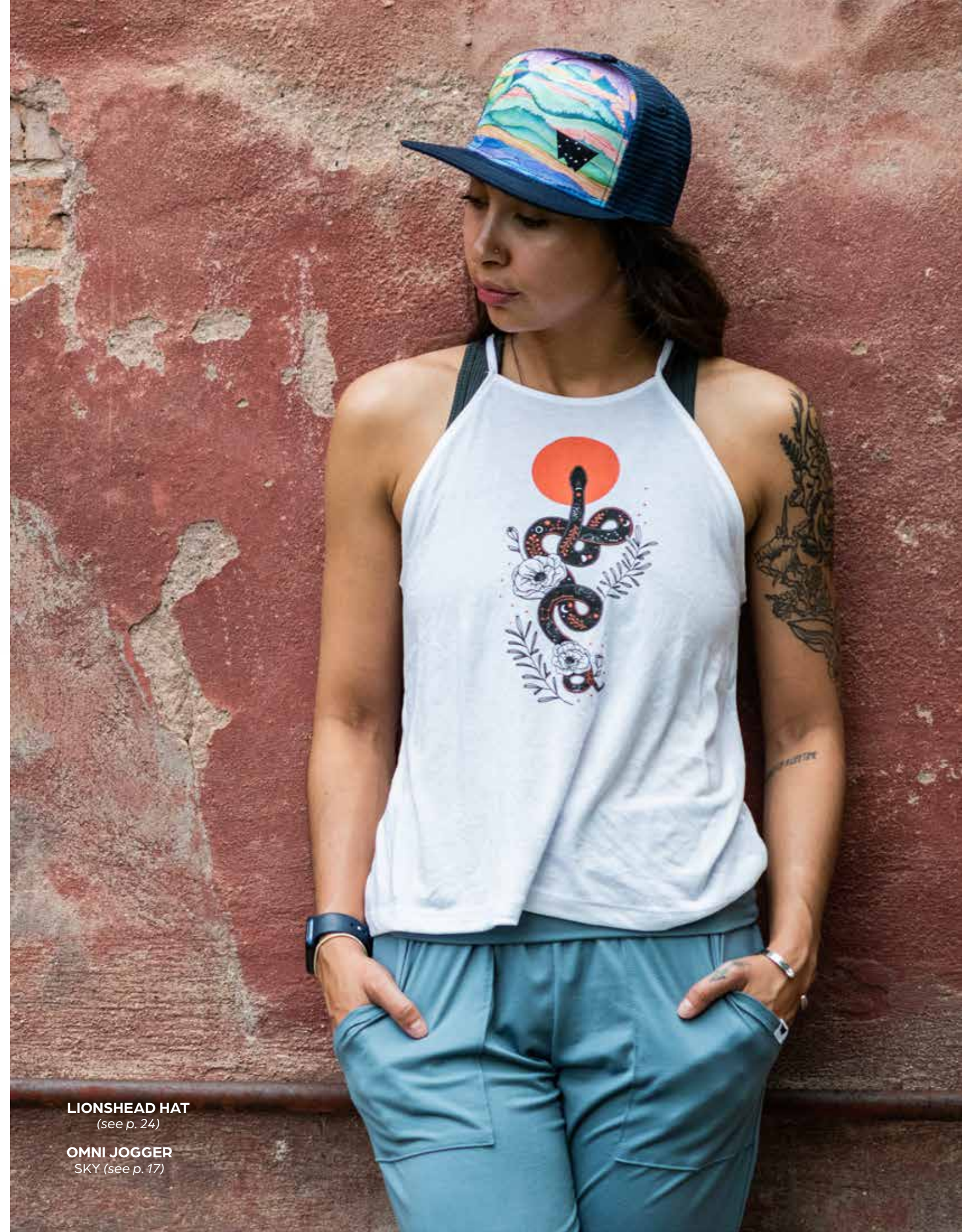
LIONSHEAD HAT (see p. 24)

Sparked from those moments spent outside in nature that recharge the soul and remind us of our purpose on this planet: to experience life fully.