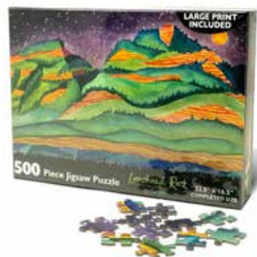
LIONSHEAD | 500 #PUZ07