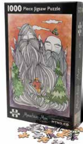
MOUNTAIN MEN | 1000 #PUZ03