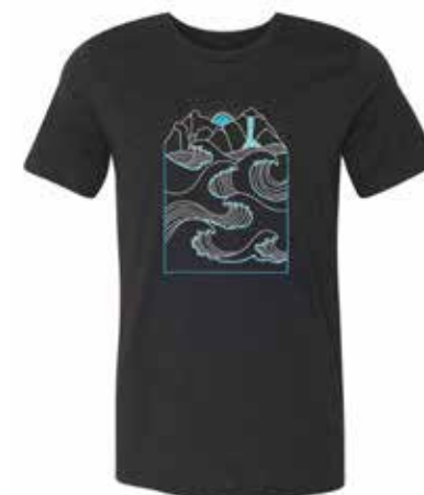
MOUNTAINS TO SEA #MT011 BLACK