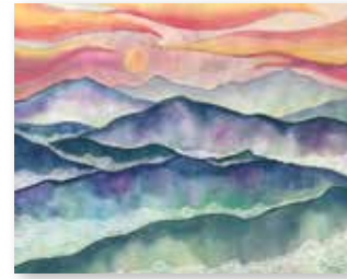
BLUE RIDGE MOUNTAINS #CRD026