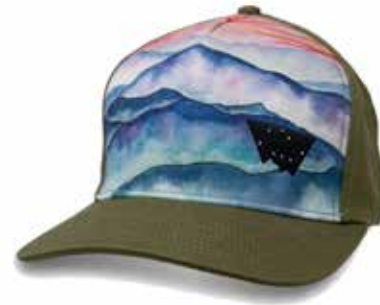
BLUE RIDGE #HAT006