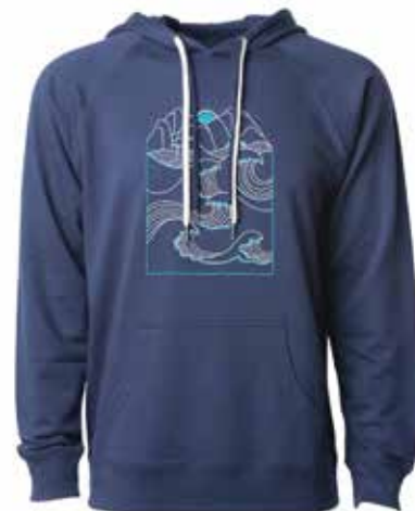
MOUNTAINS TO SEA #UH02 INDIGO