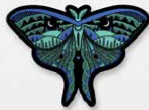
LUNA MOTH #STKR017