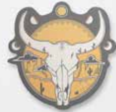
DESERT SKULL #STKR009