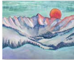
GORE RANGE, CO #CRD025