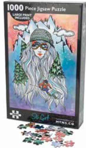
SKI GIRL | 1000 #PUZ02