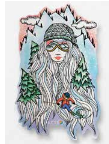
SKI GIRL #STKR004