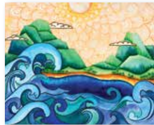
YOKOHAMA BEACH #CRD028