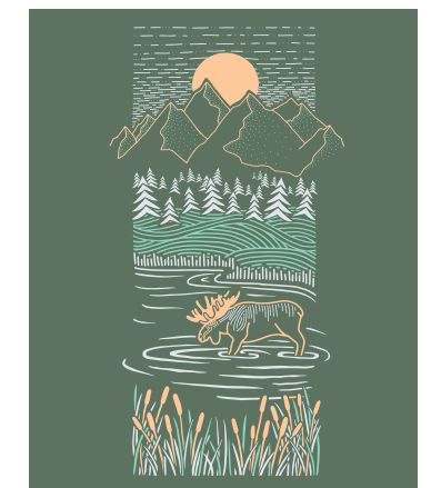
PINEY MOOSE #AP006