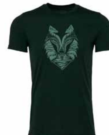
WOLF #MT012 EMERALD