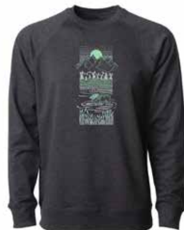
PINEY MOOSE #UP01 CHARCOAL HEATHER