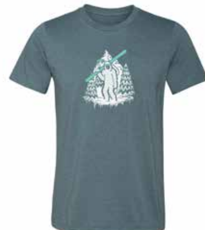
YETI #MT010 SLATE