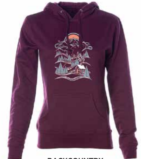
BACKCOUNTRY #WH02 CRANBERRY