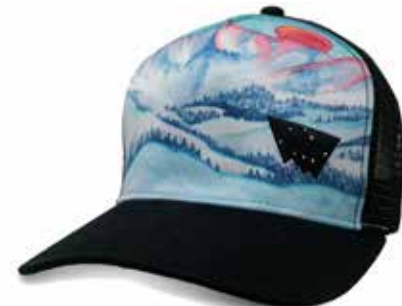
GORE RANGE #HAT008