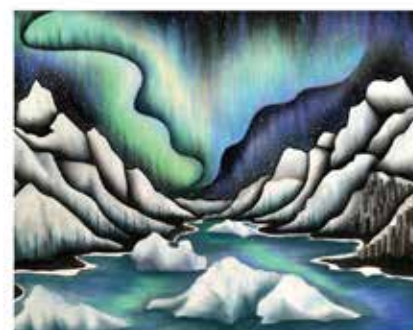
NORTHERN LIGHTS #AP015