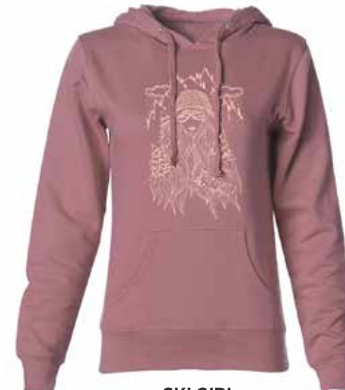
SKI GIRL #WH01 ROSE