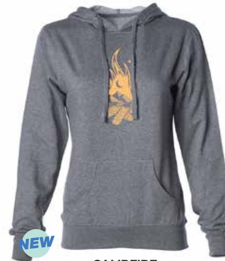
CAMPFIRE #WH03 HEATHER GRAY