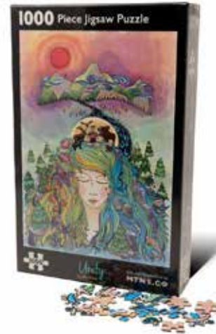
UNITY | 1000 #PUZ01