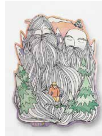
MOUNTAIN MEN #STKR001