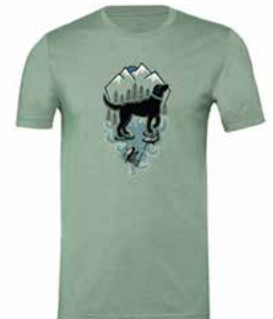
LABRADOR #MT013 SAGE