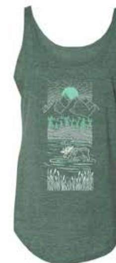
PINEY MOOSE #WFT02 PINE