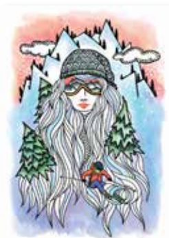
SKI GIRL #MSC01