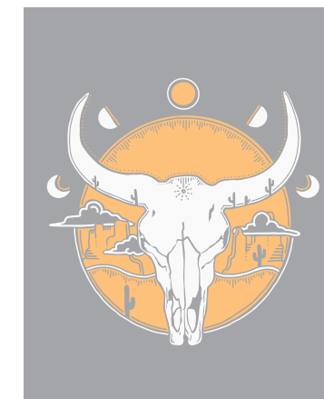
DESERT SKULL #AP005