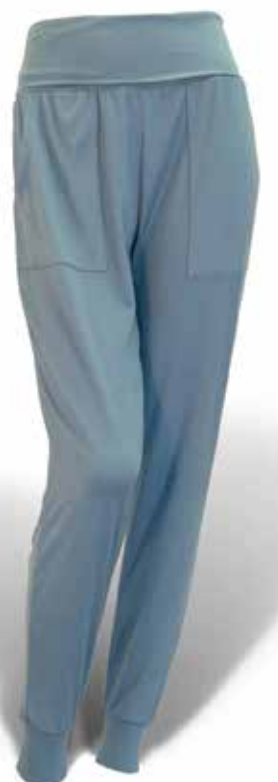
OMNI JOGGER #OMNI03 SKY