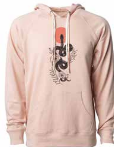
SNAKE #UH05 PETAL