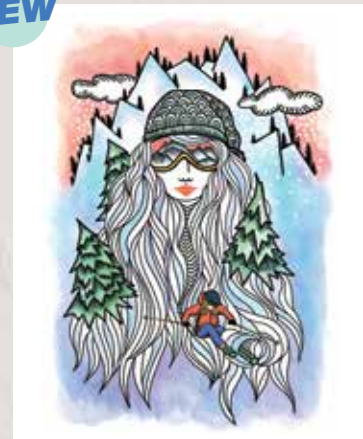
SKI GIRL #AP008