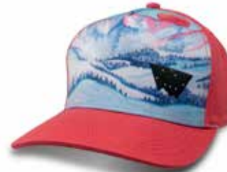
GORE RANGE #KH01