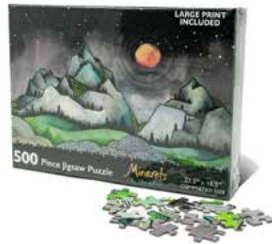
MINARET | 500 #PUZ06