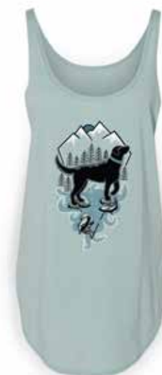
BLACK LAB #WFT01 MIST