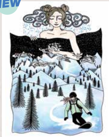
SNOWBOARD DREAMS #AP009