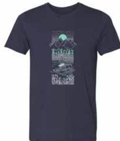
PINEY MOOSE #MT009 NAVY