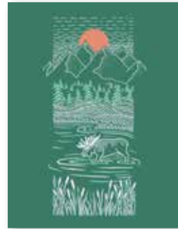
PINEY MOOSE #CRD006