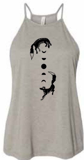
FOXES #WHNT01 SAND