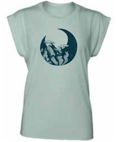
MOON MOUNTAINS #WRS04 MIST