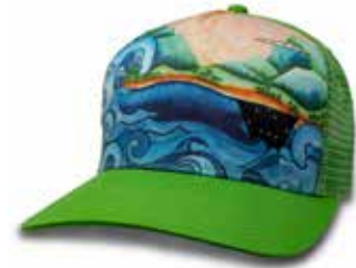
YOKOHAMA BEACH #KH02