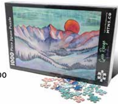
GORE RANGE | 1000 #PUZ04