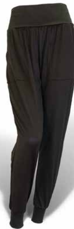
OMNI JOGGER #OMNI01 BLACK