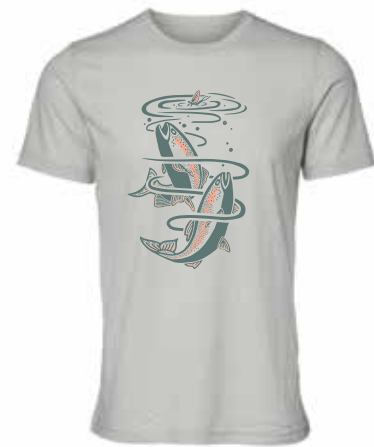
TROUT #MT008 SILVER