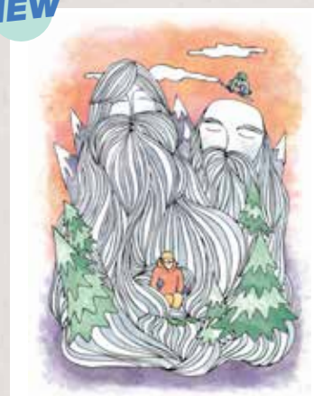
MOUNTAIN MEN #AP012