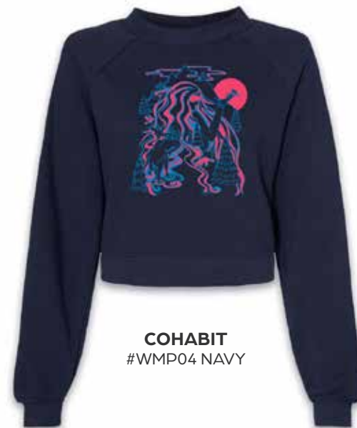
COHABIT #WMP04 NAVY