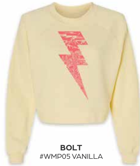
BOLT #WMP05 VANILLA