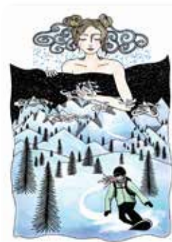
SNOWBOARD DREAMS #MSC02