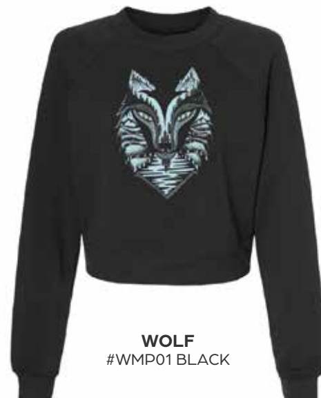
WOLF #WMP01 BLACK