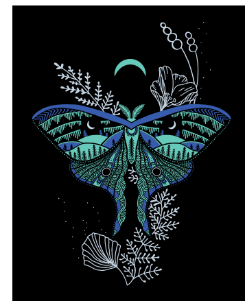
LUNA MOTH #AP004