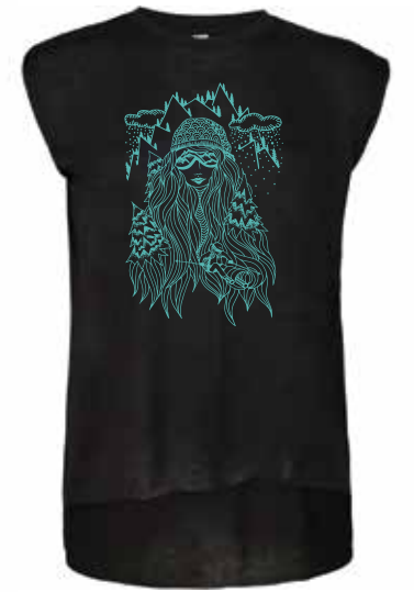
SKI GIRL #WRS05 BLACK