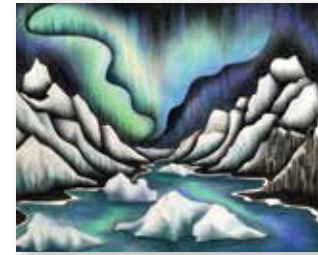
NORTHERN LIGHTS #CRD027