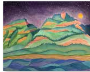
LIONSHEAD ROCK #CRD029