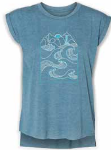
MOUNTAINS TO SEA #WRS01 HEATHER TEAL