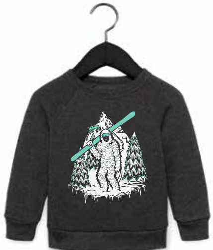
YETI #KS01 CHARCOAL