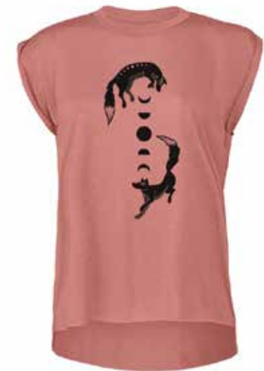
FOXES #WRS07 MOAB