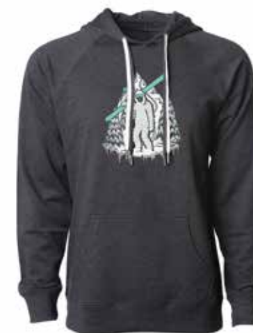
YETI #UH03 CHARCOAL HEATHER