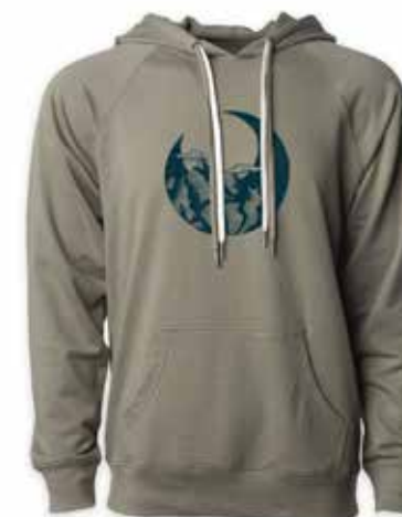
MOON MOUNTAIN #UH04 OLIVE