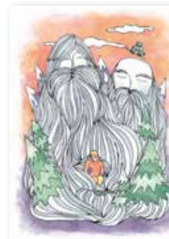
MOUNTAIN MEN #MSC05