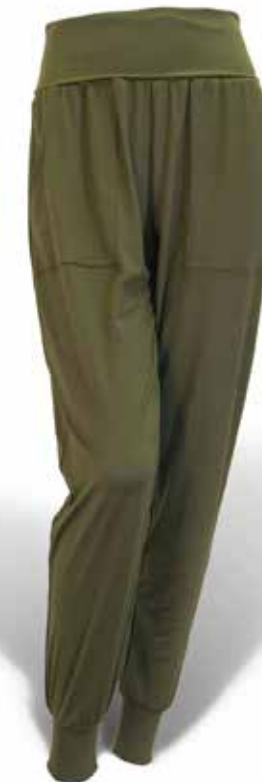
OMNI JOGGER #OMNI02 MOSS