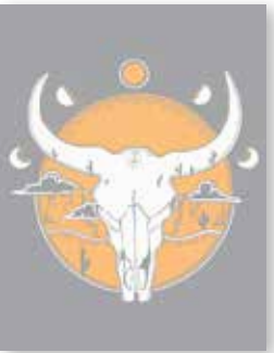
DESERT SKULL #CRD014