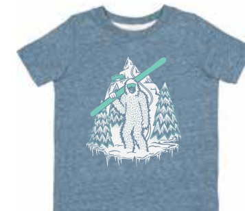
YETI #KT06 ICY BLUE