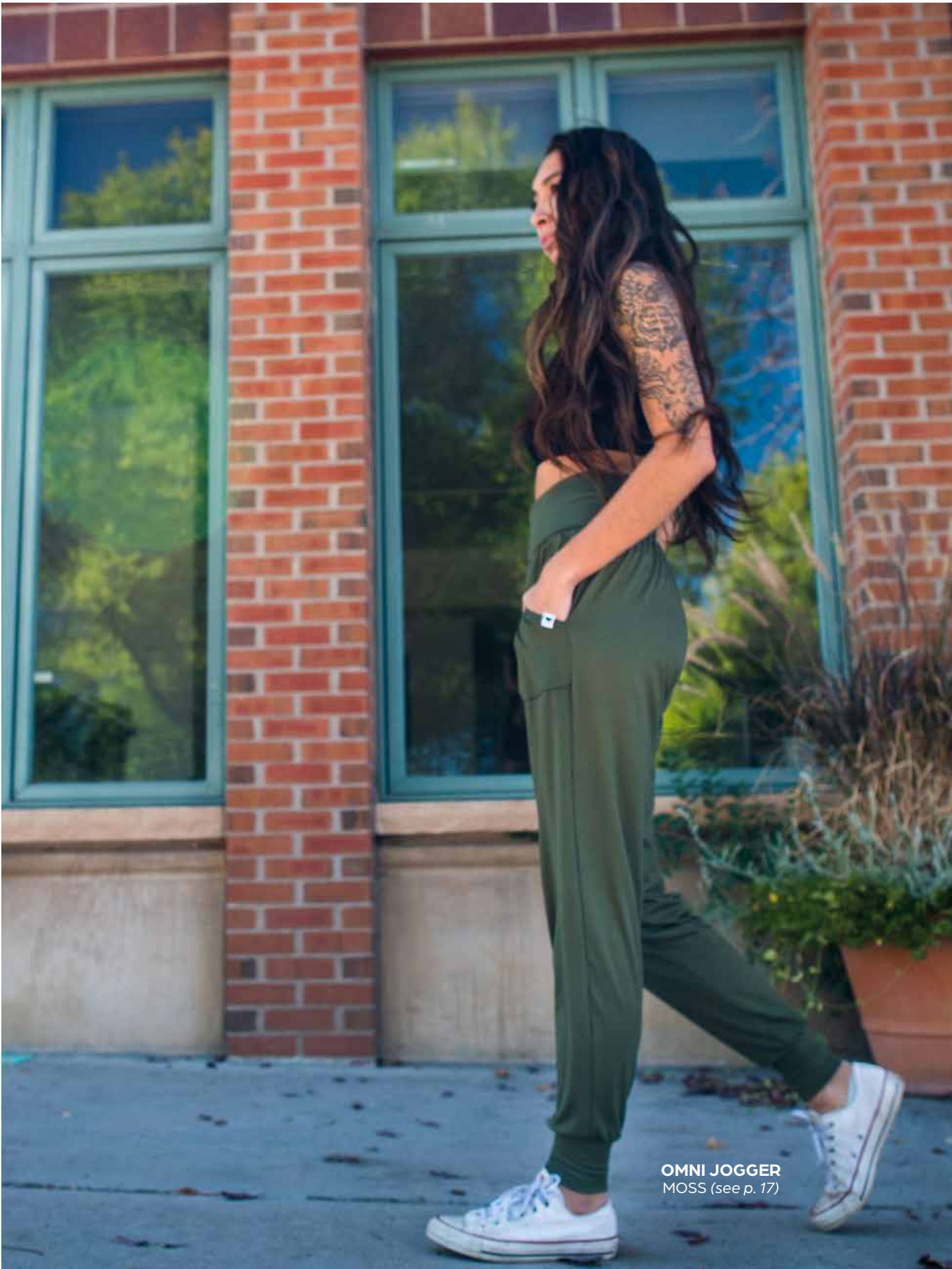
OMNI JOGGER MOSS (see p. 17)