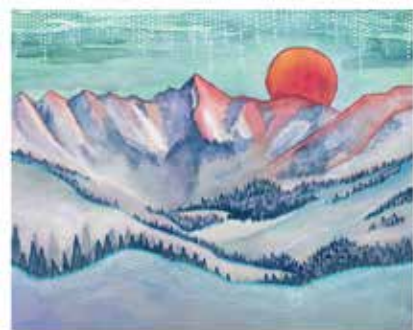
GORE RANGE - VAIL #AP014