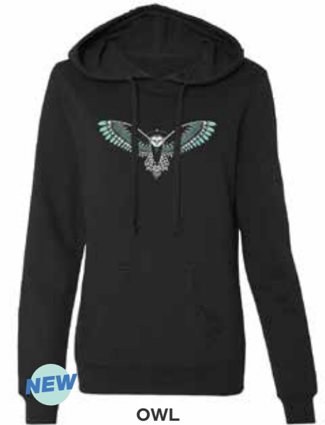
OWL #WH04 BLACK