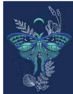
LUNA MOTH #CRD011