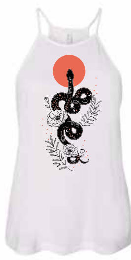
SNAKE #WHNT02 WHITE