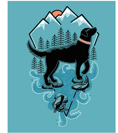
BLACK LAB #AP003