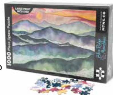
BLUE RIDGE | 1000 #PUZ05