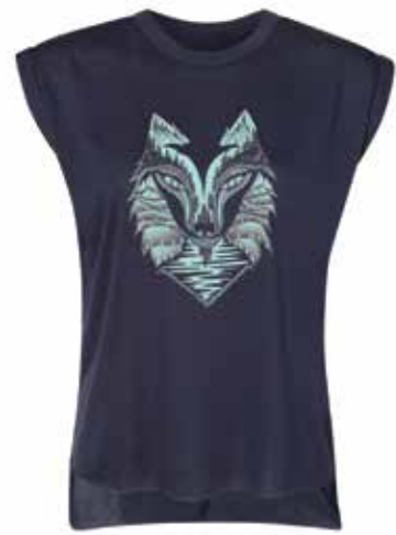
WOLF #WRS08 NAVY