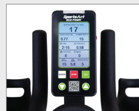
LCD Digital Display