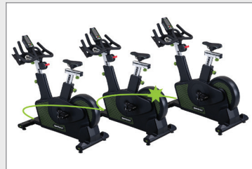
Connect Multiple Units