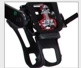
Dual-Clip Foot Pedal