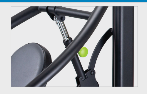
Back rest adjustment knob easily changes angle for shoulder press, incline chest press and chest press exercises