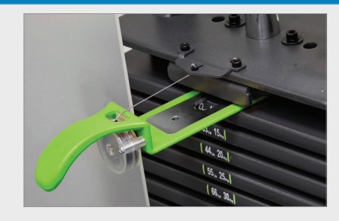
Stacks feature sound dampeners and magnetized selector fork for maximum stability