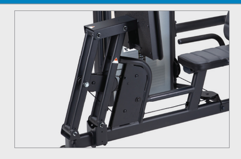
Unique 4-bar linkage system keeps the foot plate at a consistent angle for optimal lower body alignment and proper biomechanics