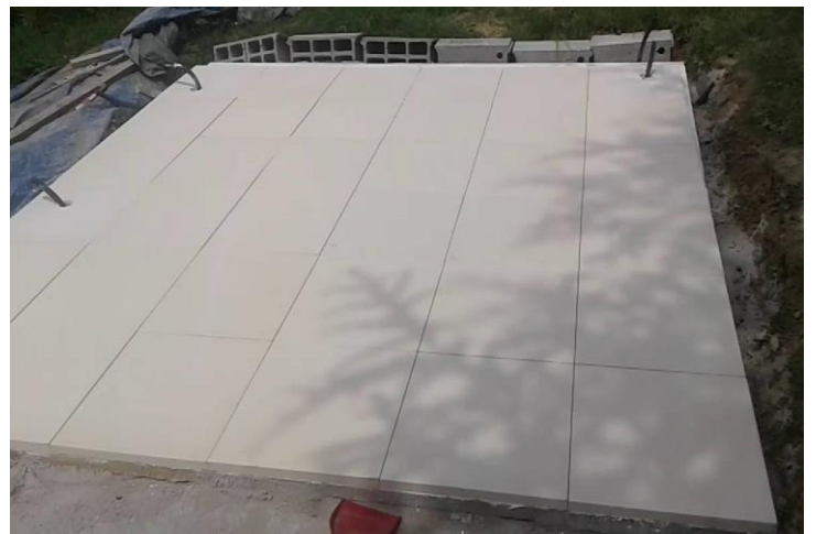
Patio Stone/Paver Blocks

It is recommended to build a base larger than required to provide a sitting area for cooling off during your sauna session.