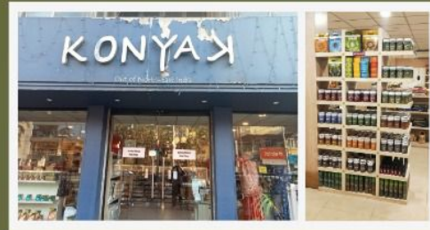
Konyak store, Guwahati