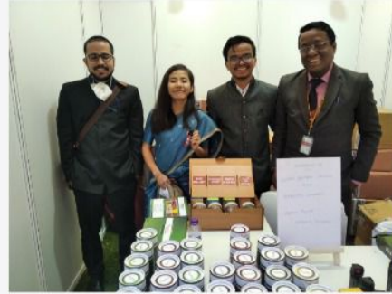
At LBSNAA, Mussoorie with trainee IAS officers