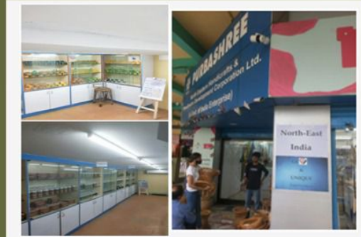
NEFSP, GI and Unique products store, Kolkata