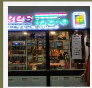
Tribes outlet (Trifed), Guwahati airport