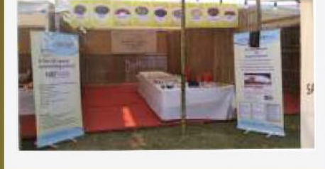
Apprising Honble Union Minister, PM office/North East/Atomic energy, Government of India, Dr Jitendra Singh sir about marketing support provided to small farmers of North East by our group of organisations during Destination North East, Varanasi, Nov, 2019