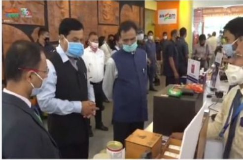
Hon'ble Ex Chief Minister Assam Shri Sonowal visit to NEFS stall.