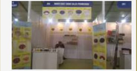
North East heritage and other tribal products launch by Shri Amit Shah, Honble Union Home Minister, Government of India at Delhi during Adi Mahotsav, Delhi, November, 19