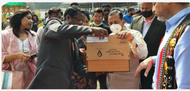
Presentation of NE GI Gift Hamper to Dr Jitendra Singh, Hon'ble Union Minister (DonER/PMO/Space), Government of India