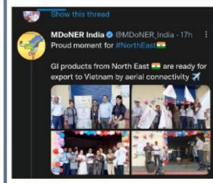
First in history by air, export from Assam to Vietnam of North East GI Food Products