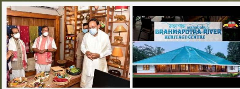
Brahmaputra River Heritage Centre, Guwahati