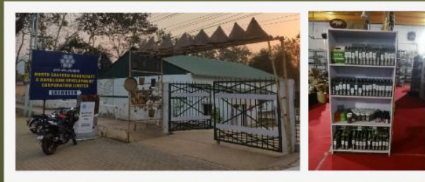
Purbashree Emporium, Guwahati