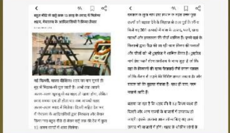
North East Heritage products launching at Noida Expo Center by Shri Mahesh Sharma, Union Culture Affairs Minister on 2nd October, 2019