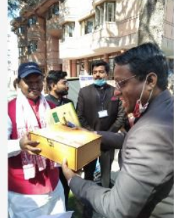
Presentation of NE GI Gift Hamper to Shri Arju Munda, Hon'ble Union Tribal Affairs Minister, Government of India