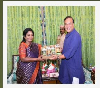
NEFS Gift Hamper being presented to Hon'ble Governor of Hyderabad by CM of Assam, Shri Himanta Biswa Sarma