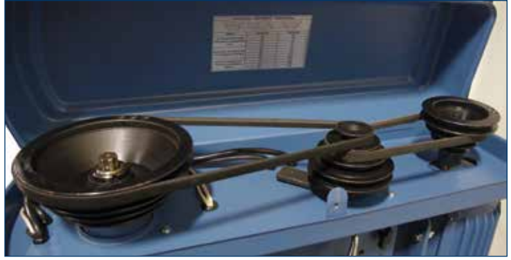
CAST IRON PULLEYS reduce vibration. Speed changes are quick and easy.