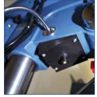
BUILT-IN LASER PROVIDES precise repeat drilling at any angle.