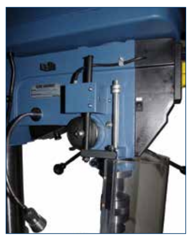
CHUCK GUARD AND LED LAMP are included. Positive depth stop allows repeated operations.