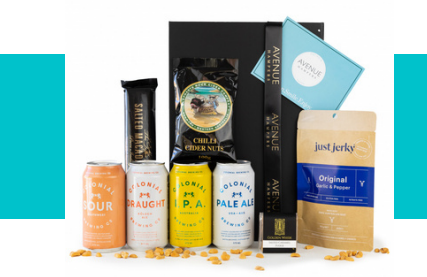
Master Brew $109