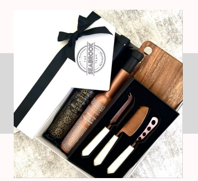
Say Cheese $99