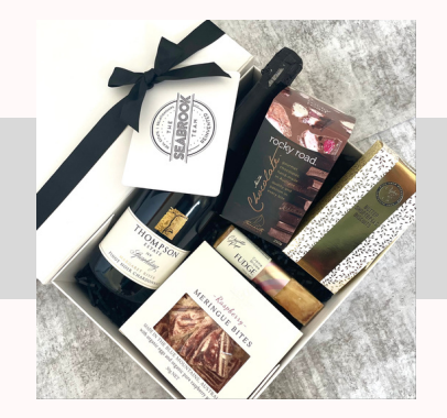
Sweet Celebration $95