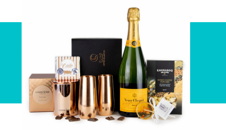
Veuve Gold $209