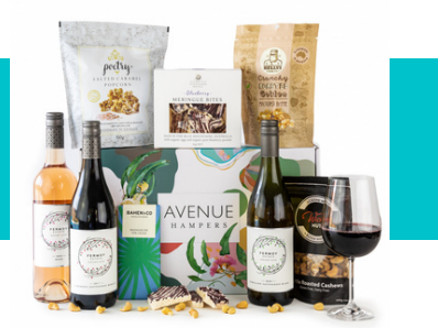
Office Share $179