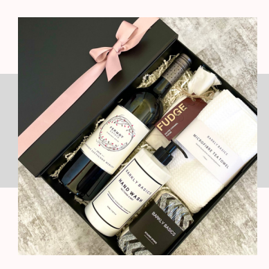
A Fresh Start $85