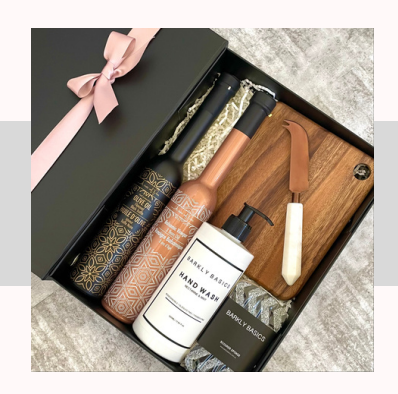
Heart of the Home $100