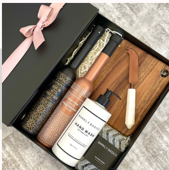
Heart of the Home