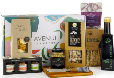
Just add Cheese $109