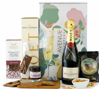
Moet Sweet & Savoury