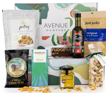
Sweet & Savoury $129