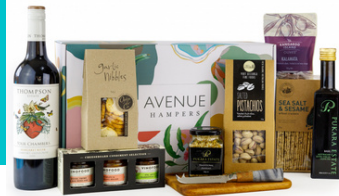
Picnic & Wine