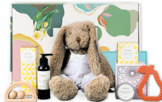
Welcome Home Baby $115