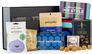
Mr Style $89

ALL PRICES INCLUDE STANDARD AUSTRALIA - WIDE DELIVERY (Click on a hamper image to find out more).