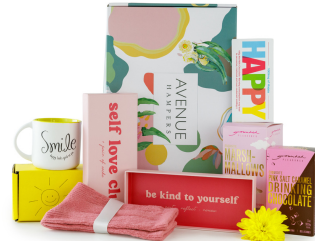
Sweet 16 $99