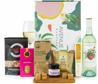
White, Sweet & Savoury