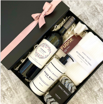
A Fresh Start

ALL PRICES INCLUDE STANDARD AUSTRALIA - WIDE DELIVERY