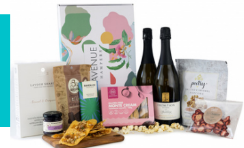
Sparkling & Strawberries