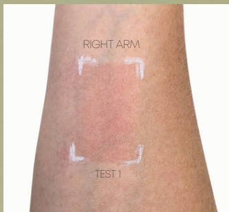
EXPOSURE TEST DONE PRIOR TO INTAKE OF ANY SUN PROTECTION