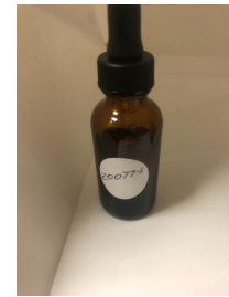
Cannabinoids (% weight)