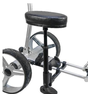
Model X9RD (X9R)

Step 1 for S2R: Slide the seat bracket bar through opening tube at lower frame connector