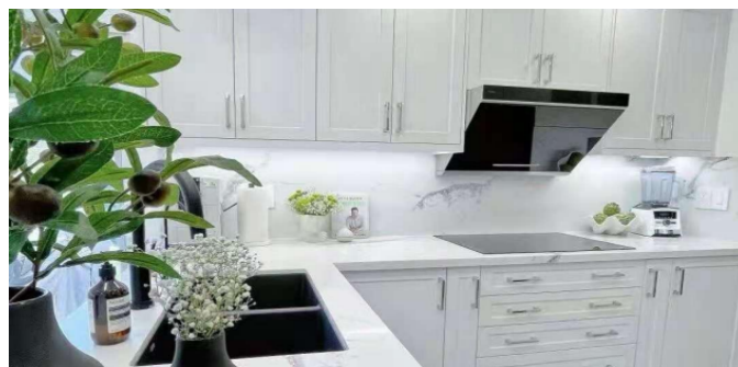
05 series JQG7505 installation example