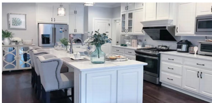
05 series JQG7505 installation example

1 years full warranty. 3 years limited warranty on all parts. Life time warranty on motor.