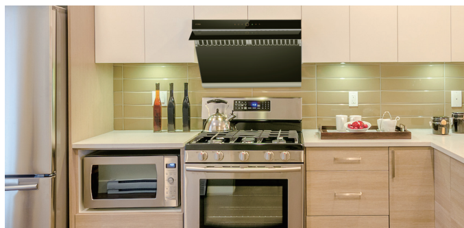
05 series JQG7505 installation example

1 years full warranty. 3 years limited warranty on all parts. Life time warranty on motor.