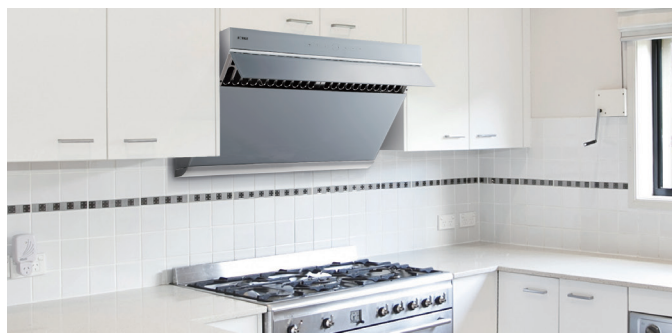
01 series JQG7501.G installation example