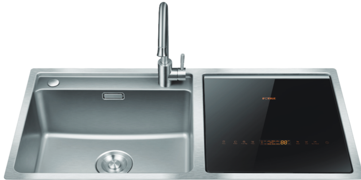
SD2F-P1X * Faucet is not included