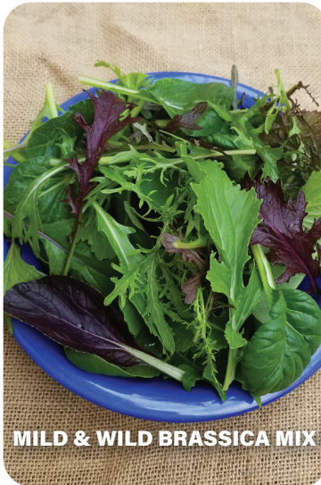
MILD & WILD BRASSICA MIX

Mix of baby leaf lettuces with a stiff yet frilly structure and good crunch. Super Frilly Mix will fill a bag quickly with its excellent loft. Bright color combination with a diversity of textures and flavors. Developed with the growers' needs in mind as well as customer satisfaction.