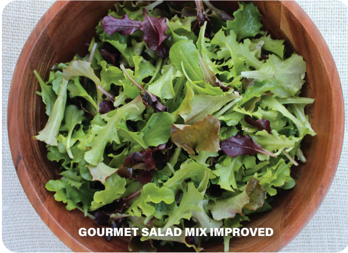
GOURMET SALAD MIX IMPROVED