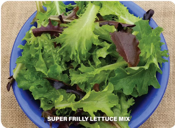
SUPER FRILLY LETTUCE MIX