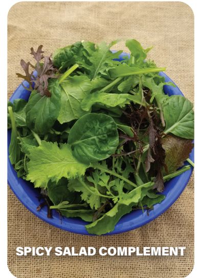
SPICY SALAD COMPLEMENT