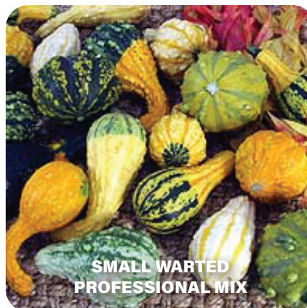
SMALL WARTED PROFESSIONAL MIX