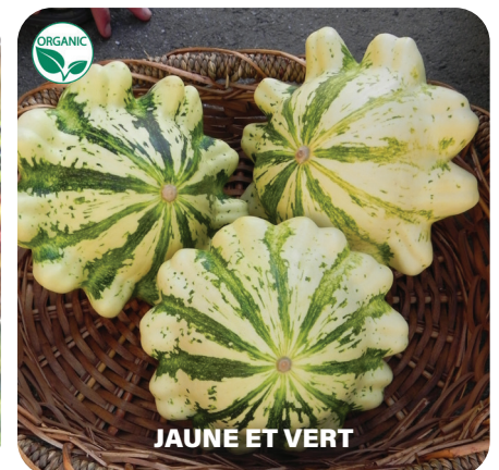
JAUNE ET VERT