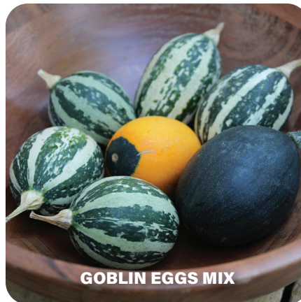
GOBLIN EGGS MIX