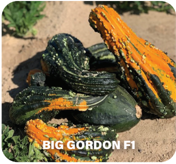
BIG GORDON F1