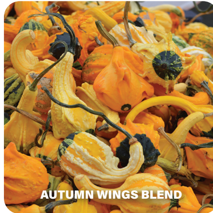
AUTUMN WINGS BLEND

Colorful gourd which displays well for fall market sales with its orange-red shoulders and protruding turban of striped red, green and white really stand out.