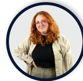
Cait Sullivan Education Support

Best known for playing the empty box, Judit makes sure your instruments arrive safely and on time. Her team can even stockpile orders until you need them, remove excess packaging and deliver anywhere you choose, across multiple sites.