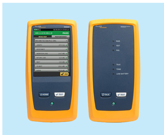
Cable tester ETHERtest V5.3