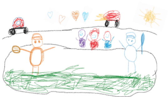
Designed by our friends at Bible Center School!