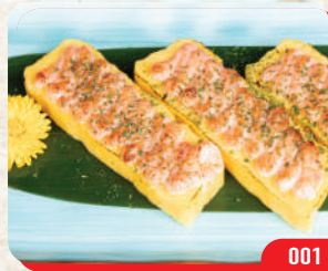
001 明太子玉子烧 MENTAIKO TAMAGO