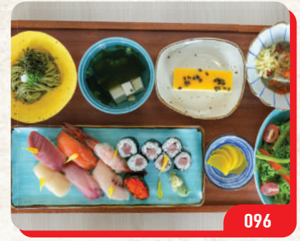
精选握寿司套餐 $36.80 PREMIUM NIGIRI SUSHI SET