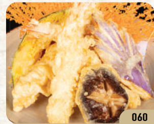
天妇罗拼盘 ASSORTED TEMPURA (TEMPURA MORIAWASE)