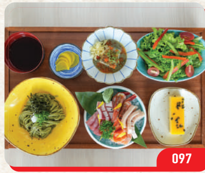
刺身拼盘套餐 $38.80 SASHIMI MORIAWASE SET