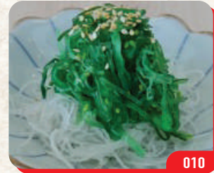
010 凉拌海带丝 CHUKA WAKAME