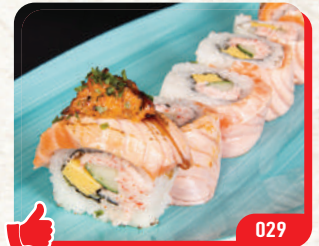
辣明太子三文鱼卷 SALMON MENTAIKO MAKI (8pcs) $14.80