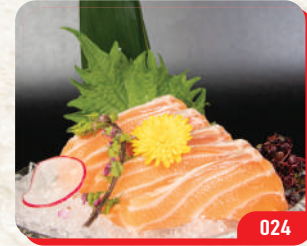
鲑鱼刺身 SAKE (SALMON) SASHIMI (5pcs) $10.80