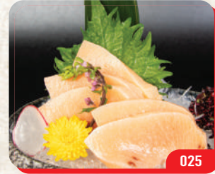
剑鱼刺身 MEKAJIKI (SWORDFISH) SASHIMI (5pcs) $12.80