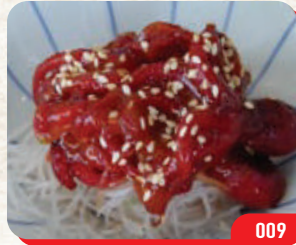
009 小章鱼 CHUKA IDAKO