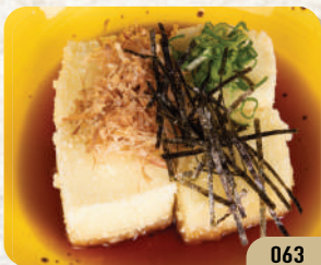
日式炸豆腐 DEEP FRY FRESH TOFU (AGEDASHI TOFU)