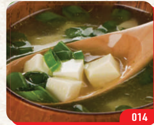
014 味噌汤 MISO SOUP