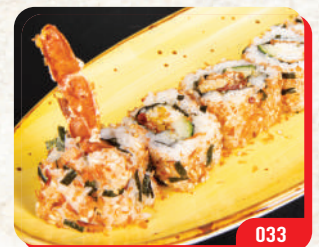
软壳蟹卷 SPIDER MAKI WITH HOMEMADE SAUCE (8pcs) $15.80