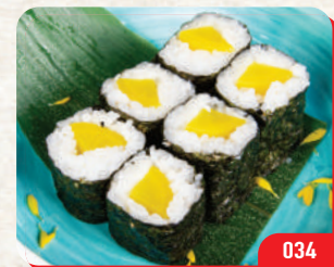
腌制萝卜卷 OSHINKO ROLL (PICKED MAKI) 6pcs $6.80