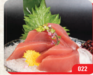
鲔鱼刺身 MAGURO (TUNA) SASHIMI (5pcs) $9.80