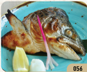
盐烤三文鱼头 GRILLED FISH HEAD (SAKE YAKI ATAMA)