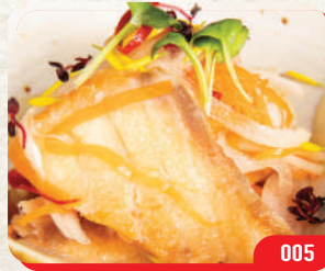
005 油醋汁炸鱼 FRIED FISH MARINATED WITH VINAIGRETTE SAUCE