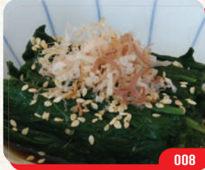
008 凉拌紫鱼菠菜 COLD SPINACH WITH BONITO (HORESHO OHITASHI)