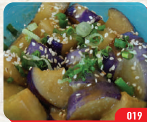
019 日式味噌炒茄子 EGGPLANT IN MISO