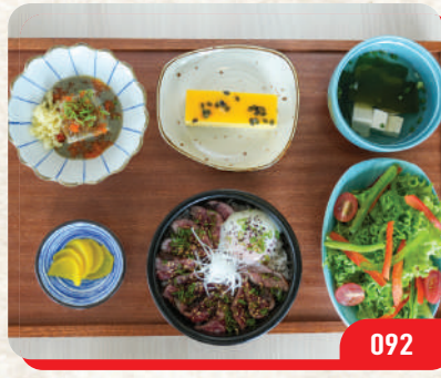
宫崎県产A5和牛套餐 $68.80 MIYAZAKI A5 WAGYU SET