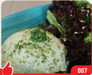
007 马铃薯沙拉 POTATO SALAD