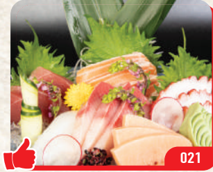
刺身拼盘 MORIAWASE $34.80