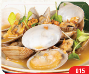
015 牛油味酥炒蛤蚧 SEA CLAM BUTTER CHOP WITH HERBS & SAKE MIRIN