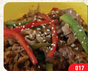
017 烧烤酱炒牛肉 BEEF YAKINIKU