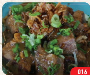
016 炒牛肉块与青椒洋葱 STIR - FRY BEEF CUBE WITH GREEN PPERCORN SAUCE AND FRIED ONION