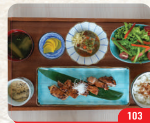
西京味噌烤鸡肉套餐 $20.80 SAIKYO MISO CHICKEN SET