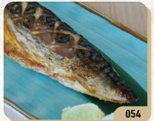
盐烤鲭鱼 SABA SHIO