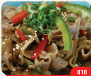
018 烧烤酱炒豚肉 PORK YAKINIKU