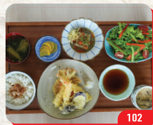
天妇罗拼盘套餐 $25.80 TEMPURA SET