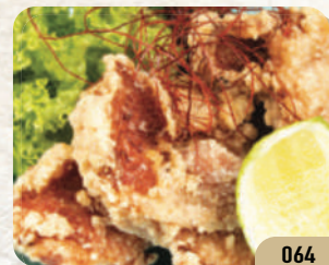
香炸鸡肉块 DEEP FRY CHICKEN CUBE (TORI KARAAJE)