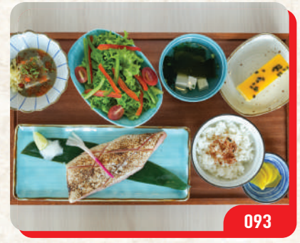
盐烤三文鱼腩套餐 $35.80 GRILLED SALMON BELLY SET