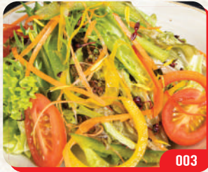
003 蔬菜沙拉 GREEN SALAD (YASAI SALAD)