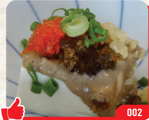
002 皮蛋豆腐 CENTURY EGG TOFU (PIDAN TOFU)