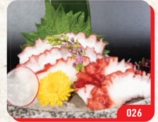
章鱼刺身 TAKO (OCTOPUS) SASHIMI (5pcs) $8.80