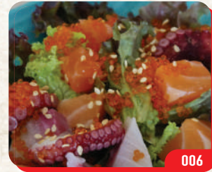
006 海鲜沙拉 WAFU SEAFOOD SALAD