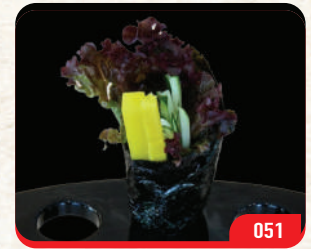
腌制萝卜手卷 PICKED HANDROLL (OSHINKO TEMAKI)