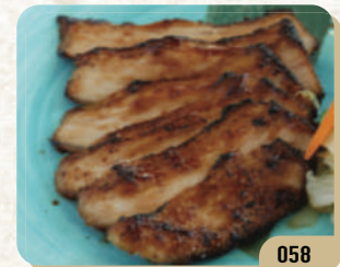
酱烤黑豚豚肉 佐日式腌菜 GRILLED PORK JOWL WITH PRESERVED BEAN SAUCE AND PICKED VEGGIE