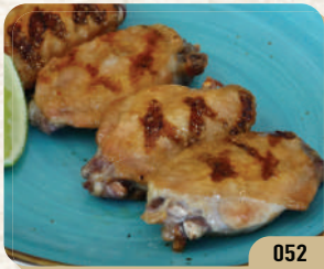
盐烤中鸡翅 CHICKEN MID WINGS