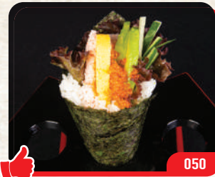
加州手卷 CALIFORNIA HANDROLL (CALIFORNIA TEMAKI)