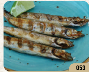
烤多春鱼 PREGNANT CAPELIN (SHISHAMO SHIO)