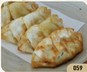
日式炸饺子 JAPANESE DUMPLING (AGE GYOZA)