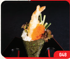
天妇罗虾手卷 PRAWN HANDROLL (EBI TEMPURA TEMAKI)