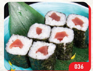
金枪鱼细卷 TUNA ROLL (6pcs) $7.80