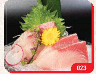
黄尾鱼刺身 HAMACHI (YELLOWTAIL) SASHIMI (5pcs) $10.80