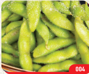
004 毛豆 JAPANESE SOY BEAN (EDAMAME)