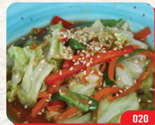
020 炒蔬菜 YASAI ITAME