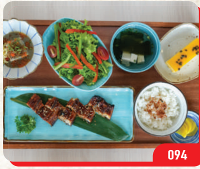
蒲烧鳗鱼套餐 $32.80 GRILLED UNAGI SET