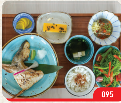
盐烤鰺鱼下巴套装 $33.80 GRILLED HAMACHI KAMA SET