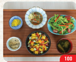
什锦刺身丼套餐 $24.80 BARA CHIRASHI DON SET