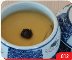
012 黑松露茶碗蒸 TRUFFLE CHAWANMUSHI