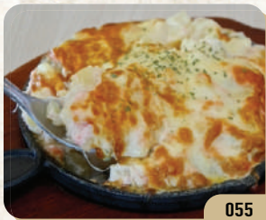
烤芝士马铃薯与 明太子 BAKED POTATO & ONION WITH SPICY TALAMASALATA