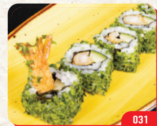
天妇罗炸虾卷 TEMPURA ROLL (EBI FRY MAKI) 8pcs $12.80