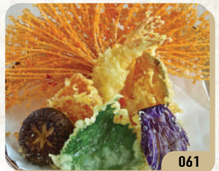
蔬菜天妇罗 MIXED VEGETABLE TEMPURA