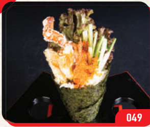
炸软壳蟹手卷 SOFT SHELL CRAB HANDROLL (APIIDER TEMAKI)