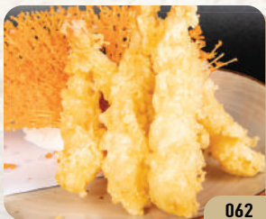
天妇罗虾 PRAWN TEMPURA (EBI TEMPURA)