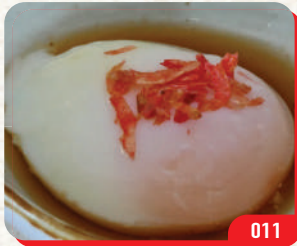
011 樱花虾温泉蛋 ONSEN TAMAGO