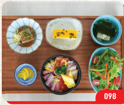
散寿司套餐 $37.80 CHIRASHI SET