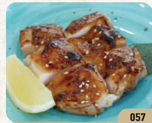
烤味噌鸡腿肉 GRILLED SAIYO MISO BONELESS CHICKEN LEG