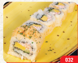
香辣鸡丝卷 SPICY CHICKEN FLOSS (8pcs) $11.80