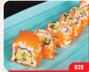
加州卷 CALIFORNIA ROLL (8pcs) $11.80