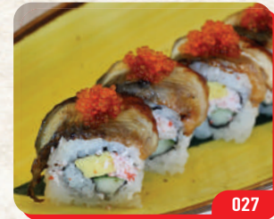
鳗鱼卷 UNAGI MAKI ROLL (8pcs) $14.80