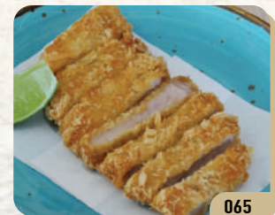
炸猪扒 PORK KUROBUTA TONKATSU