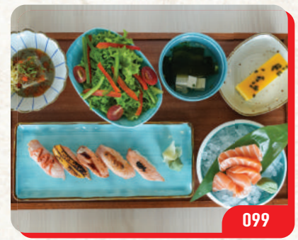
双拼三文鱼套餐 $31.80 PREMIUM SALMON DUO SET