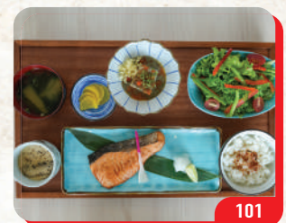
照烧三文鱼套餐 $26.80 SALMON TERIYAKI SET