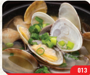
013 蛤蚧豆腐汤 ASARI TOFU SOUP