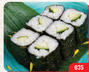
黄瓜细卷 CUCUMBER ROLL (6pcs) $6.80