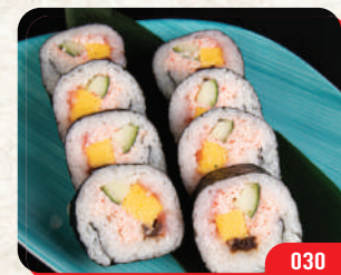
特大卷 JUMBO ROLL (FUTO MAKI) 8pcs $10.80