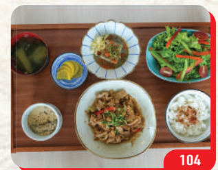
炒豚肉/牛肉套餐 $25.80 PORK/BEEF YAKIMIKU SET