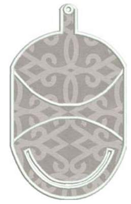
12545-01 Gift Card Holder FSA 3.81 X 6.43 in. 96.77 X 163.32 mm 8,733 St. ♥ L

Note: Some designs in this collection may have been created using unique special stitches and/or techniques. To preserve design integrity when rescaling or rotating designs in your software, always rescale or rotate designs using the handles directly on-screen.