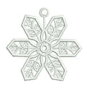
12545-02 Snowflake 1 FSL 1.95 X 1.88 in. 49.53 X 47.75 mm 5,882 St. 3€ ○